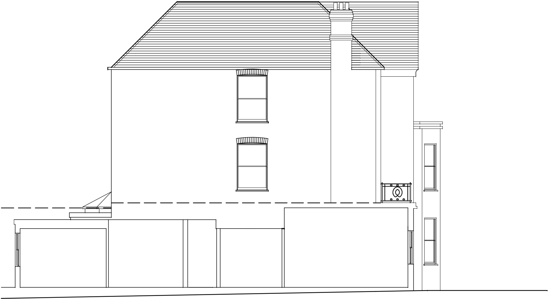
EXISTING SECTIONAL ELEVATION @ A-A

NOTE : UPPER FLOORS NOT FULLY SURVEYED. INFORAMTION TAKEN FROM PHOTOGRAPHS ONLY .