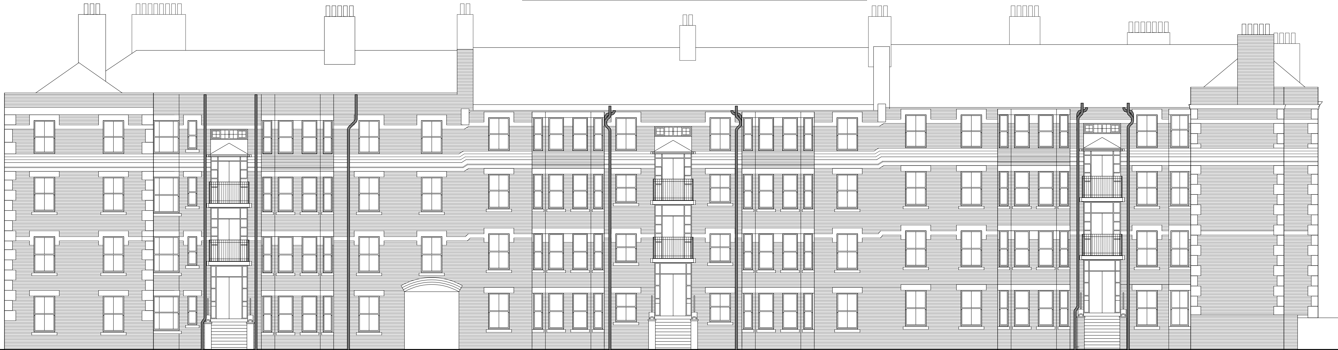
EAST (FRONT) ELEVATION (B)