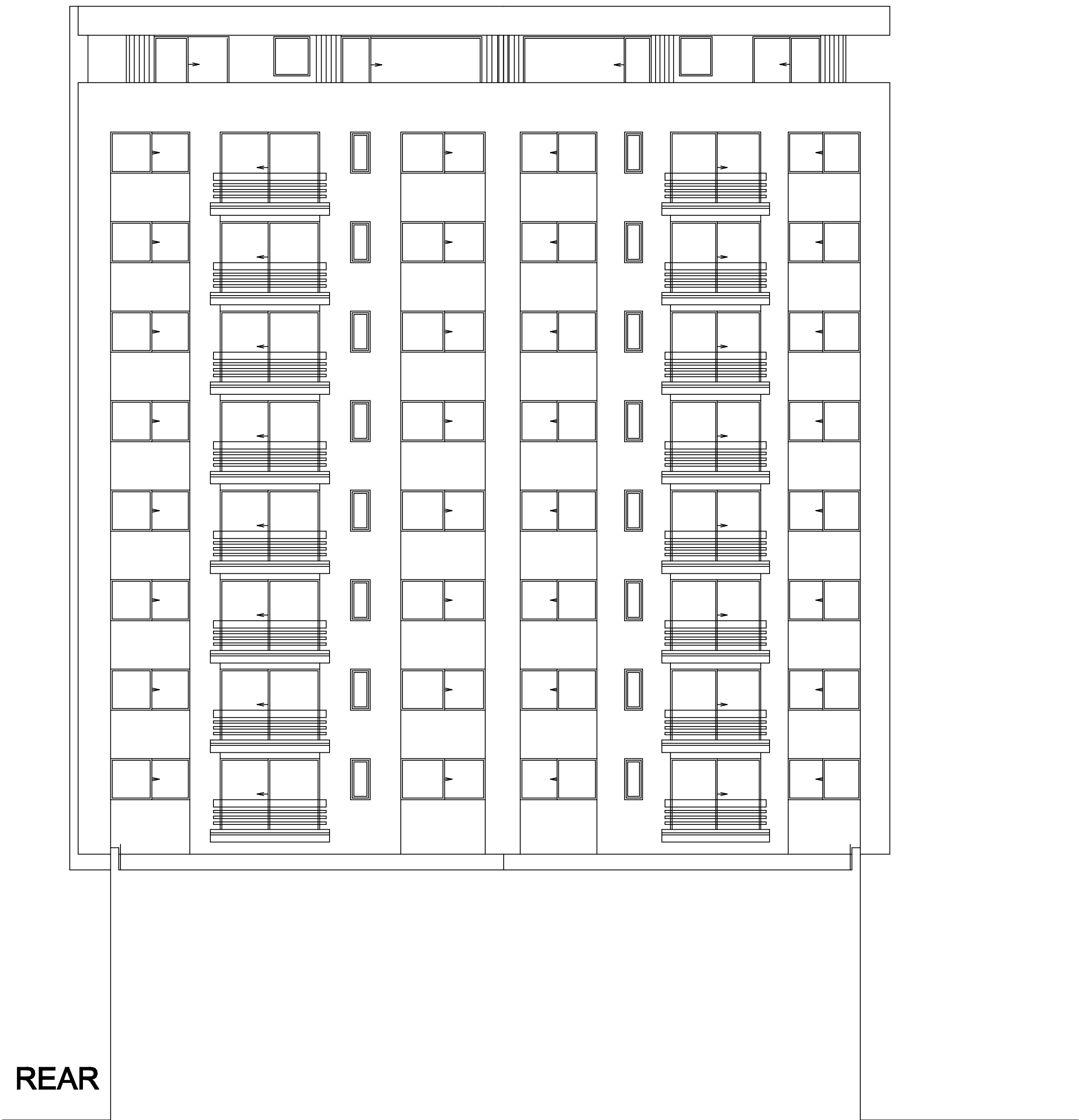
ELEVATION E with indicative ELEVATION F added