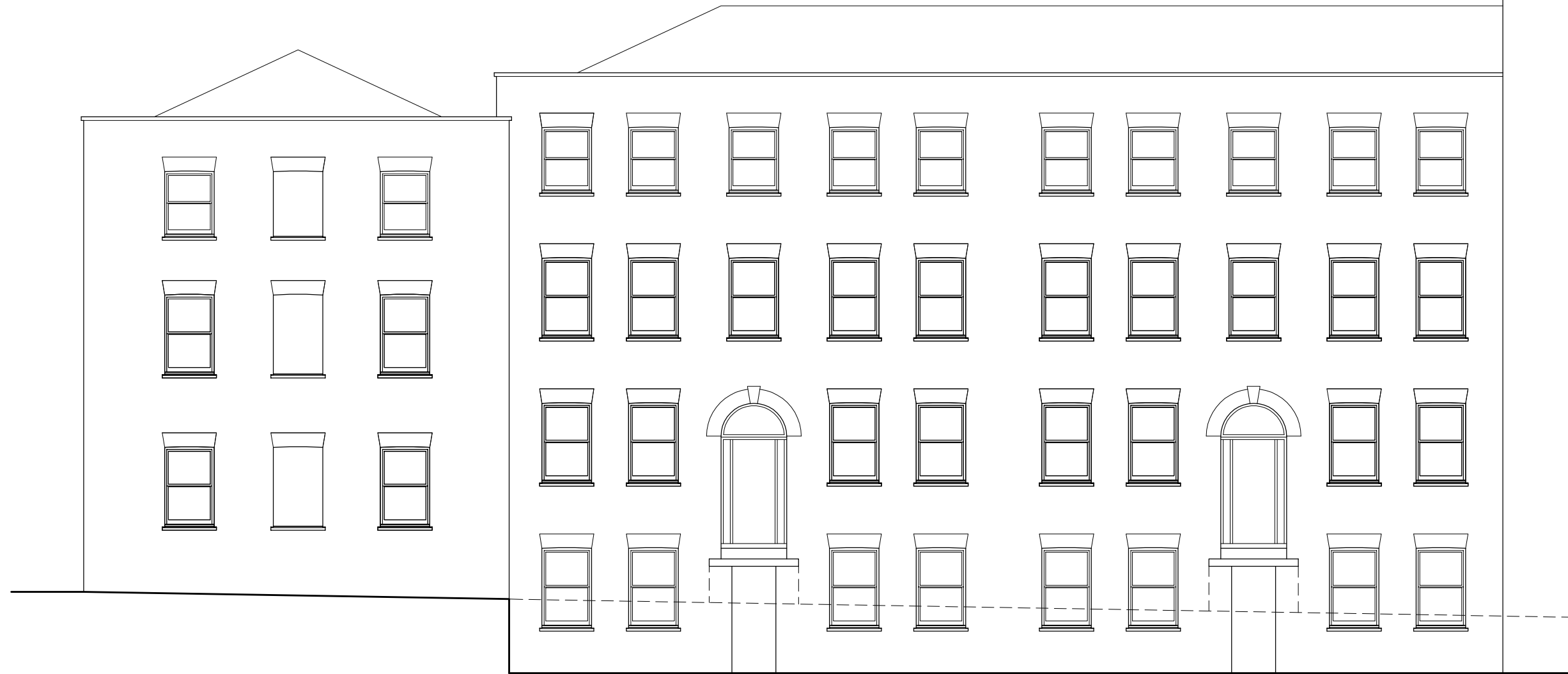
HIGHGATE ROAD (SOUTH) ELEVATION