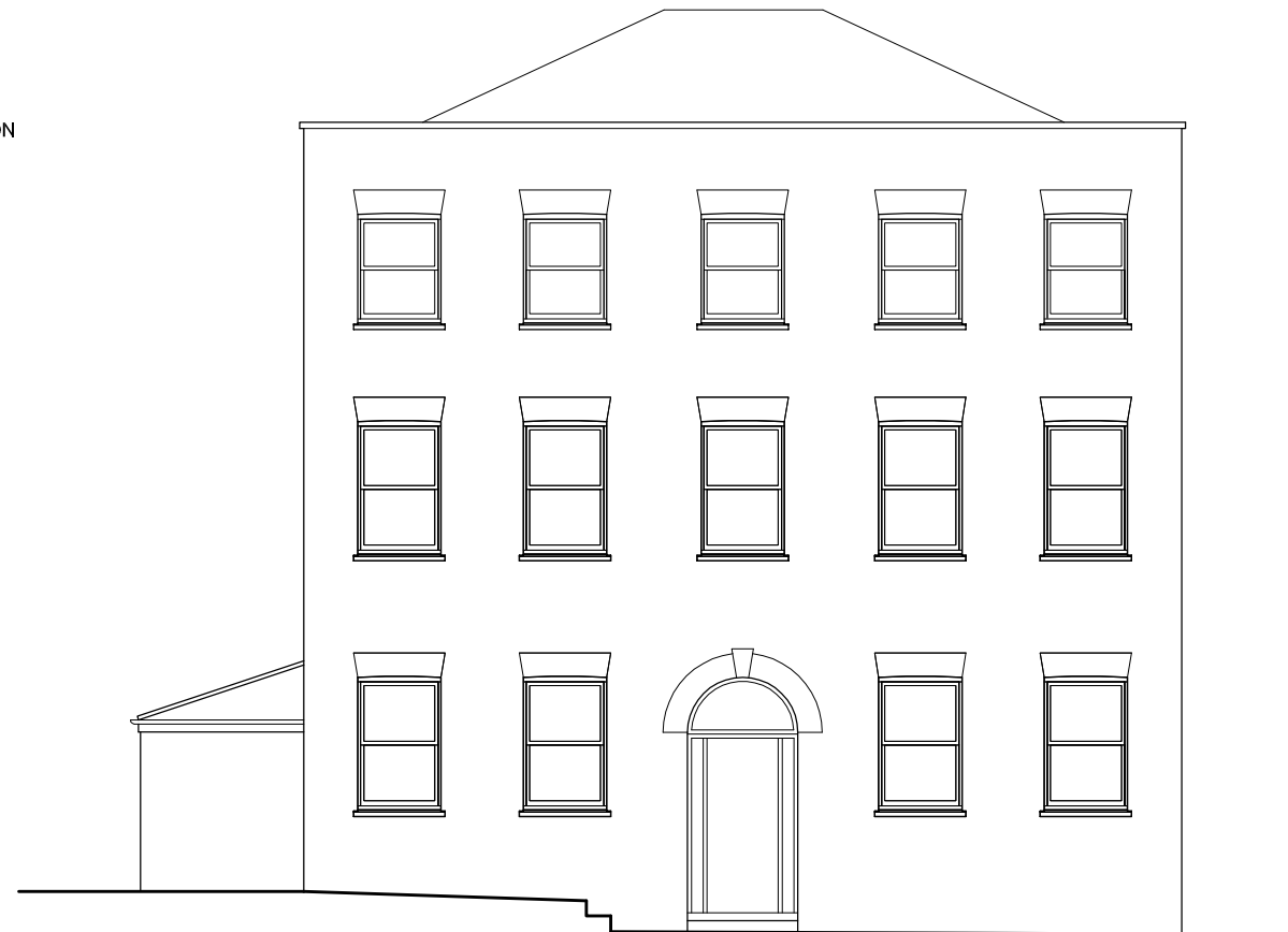
9 COLLEGE YARD (WEST) ELEVATION