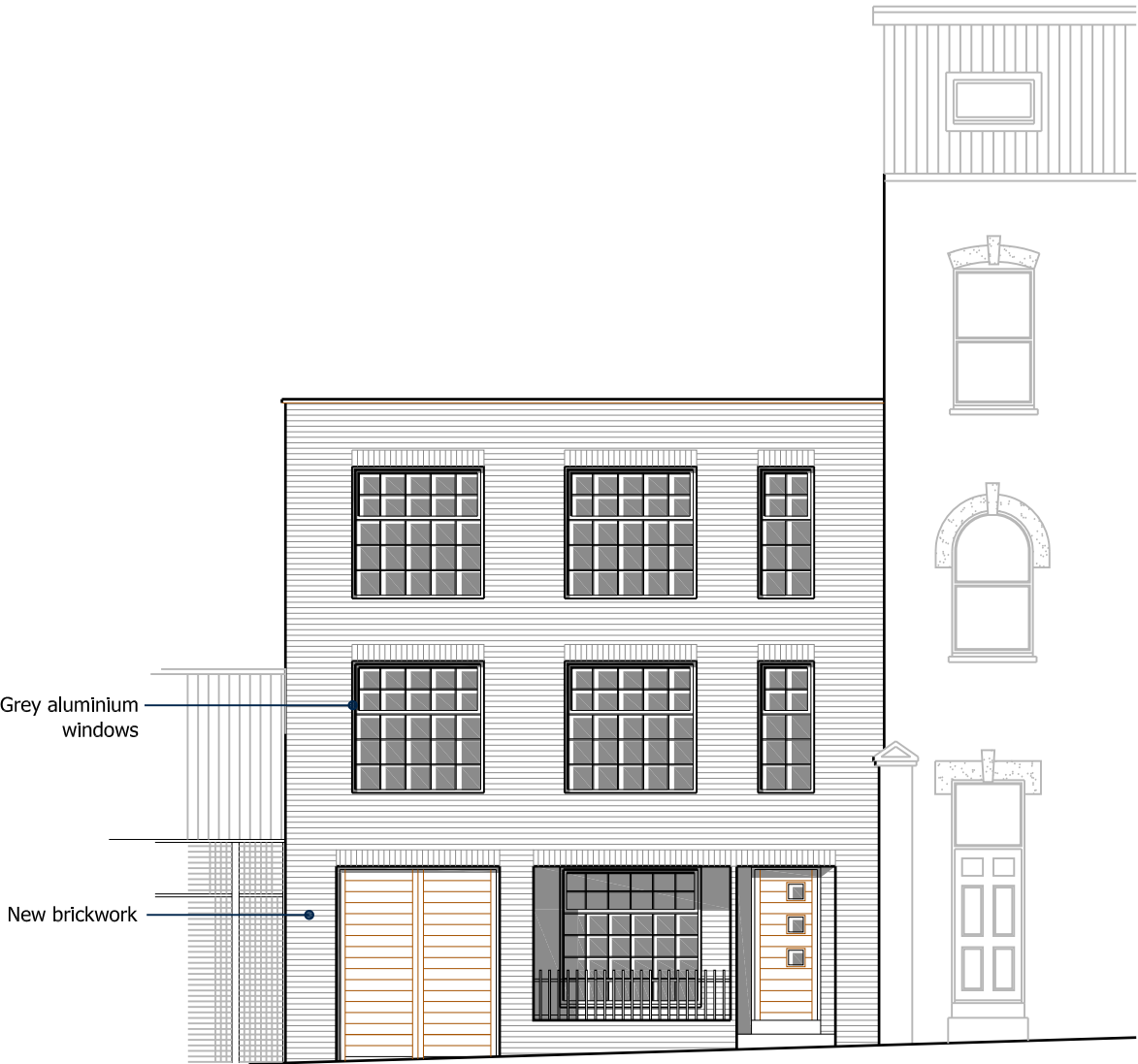
Proposed Kingsgate Road Elevation 1:100