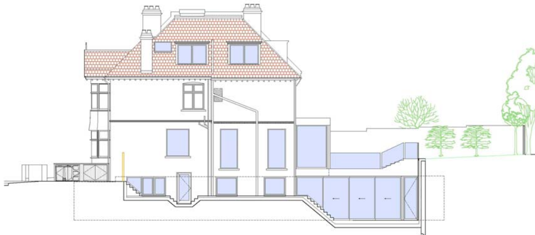
Proposed rear & side elevations showing dormers

Natural light will be brought into the basement via discreet openings including lightwells in the side alley and glass floor panels to the patio to the rear of the extension as well as a recessed glass wall onto a new light well and escape stair in the rear garden. With the reduction in size of the proposed rear extension, there will not be any loss of garden area would be minimal and the scheme would not have a visual impact on the character of the Conservation Area. The proposed accommodation has been carefully considered to make the best use of the available amenity. The excavation is planned to achieve a ceiling height identical to the existing ground floor in the new storey so that the new level would enjoy a bright and spacious feel.