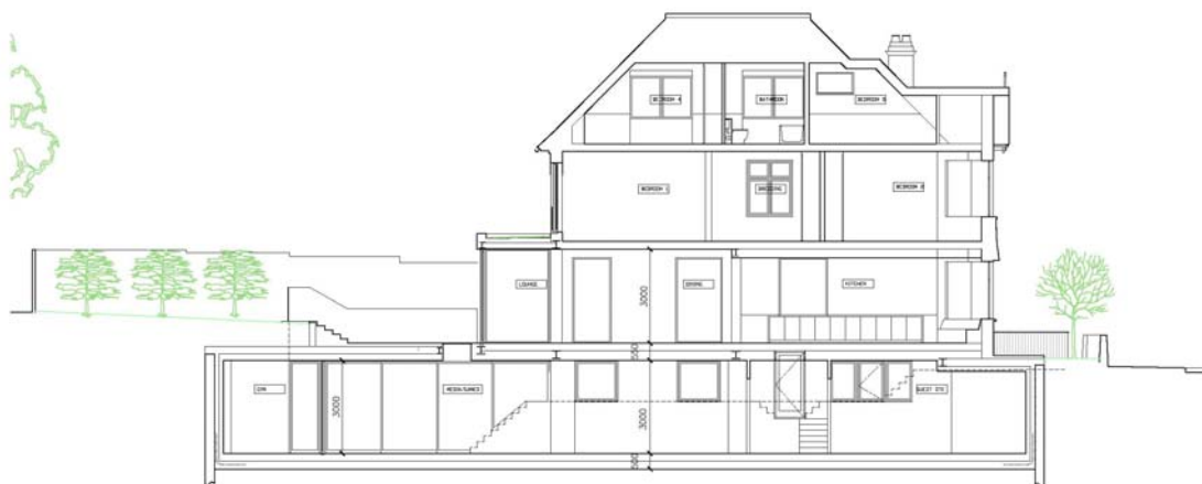
Proposed longitudinal section

The revised scheme is identical to the consented scheme with respect to its basement extensions under the front and rear gardens. The roof of the basement would be fully integrated and intensively planted making it effectively invisible within the garden aside from a modest light well to one side. The raised level of the existing lawn allows the installation of a substantial, deep roof garden with mature planting to a minimum depth of 500mm providing no restriction on the species and size of the new planting. The basement is offset from the shared property boundaries in order to allow full depth planted borders. To the front of the property, a small basement extension would again be hidden below intensive planting with a wide band of planting behind the rebuilt boundary wall. The completed garden after the works would contribute fully to the verdant character of this part of the Belsize Conservation Area, and would maintain its amenity value for both this dwelling and the outlook of neighbouring properties.