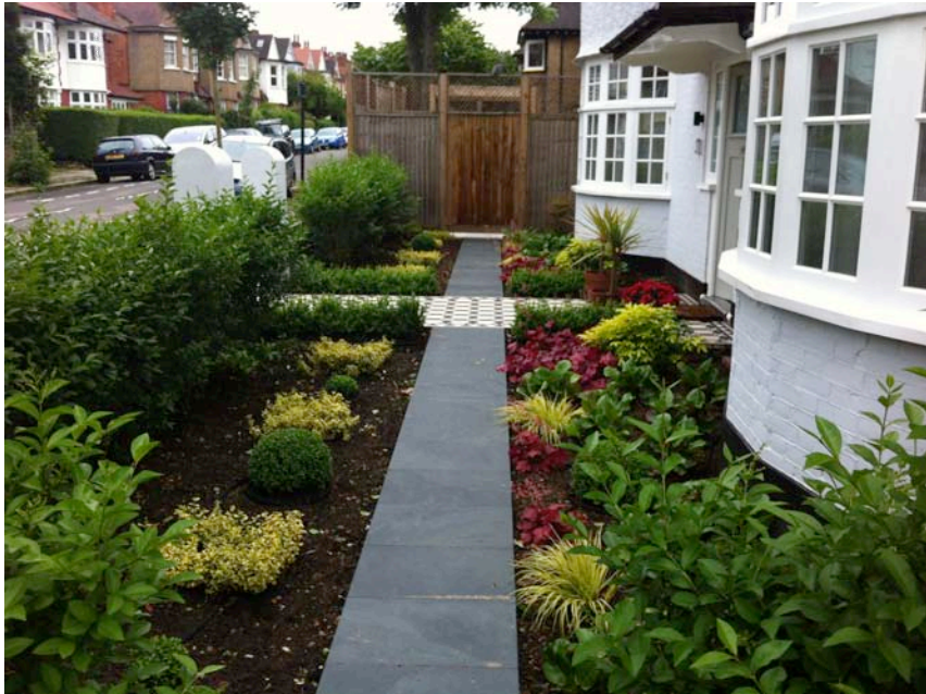
Photo of the front garden as in June 2012