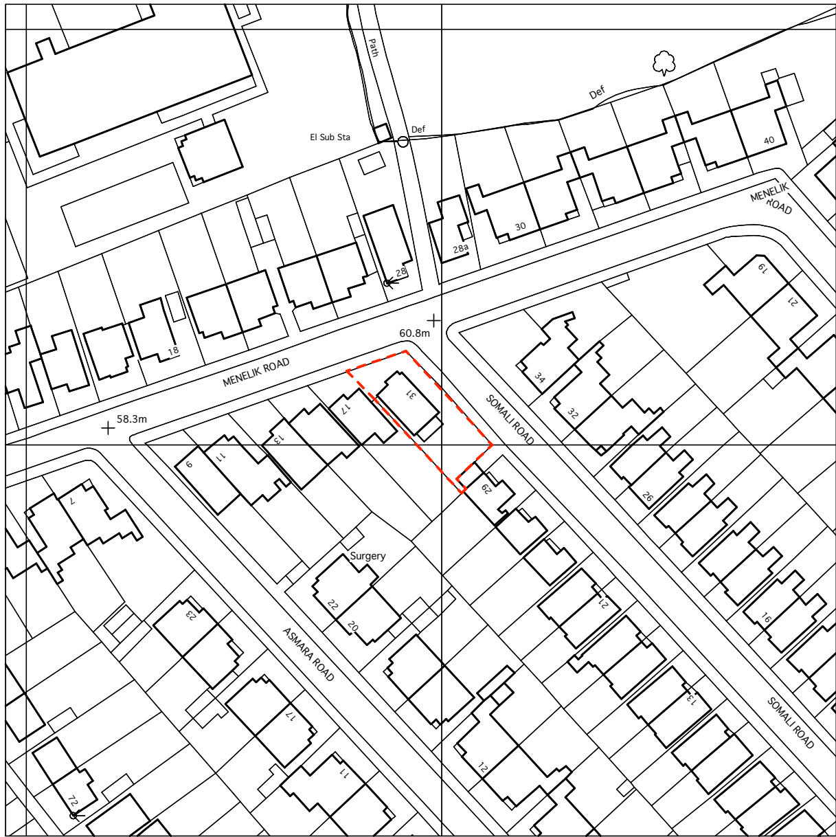
OS SITE PLAN @ 1:1250