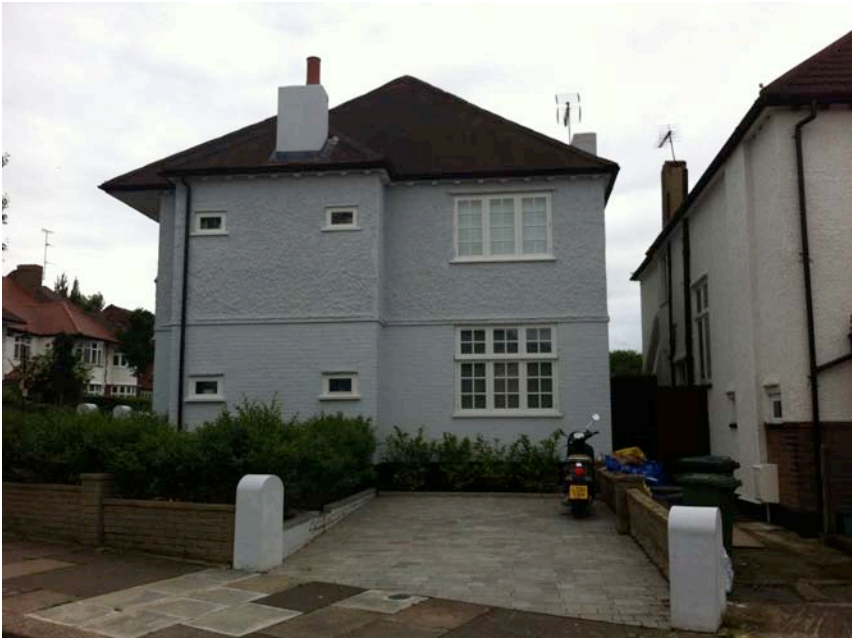
Photo of the side front garden as in June 2012