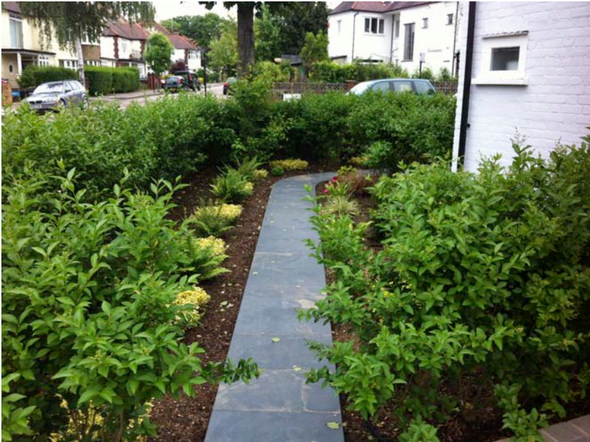
Photo of the front garden as in June 2012