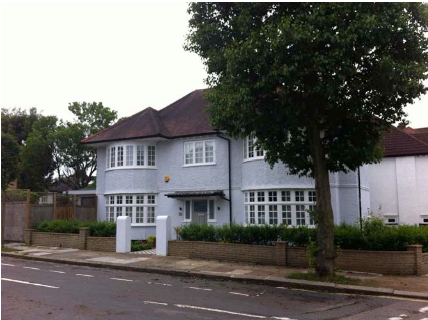
Photo of the Somali Rd frontage as in June 2012