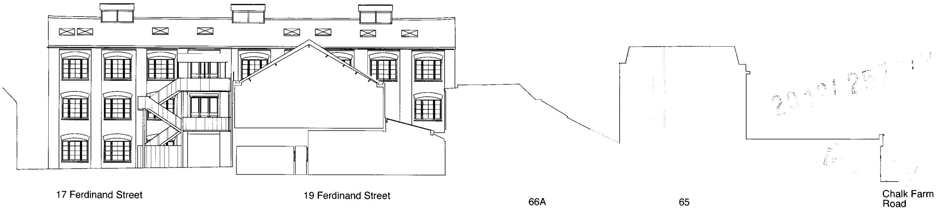
EXISTING SECTION CC