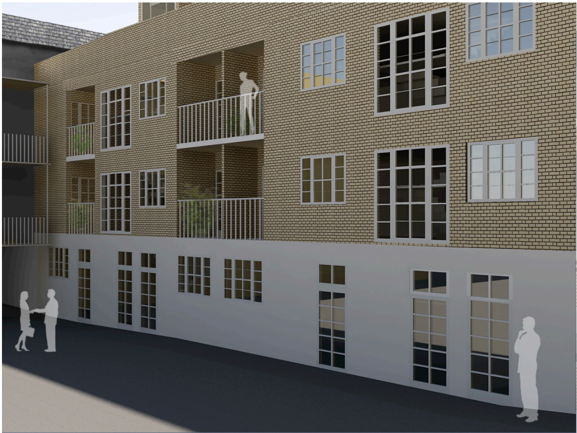
Front view 3