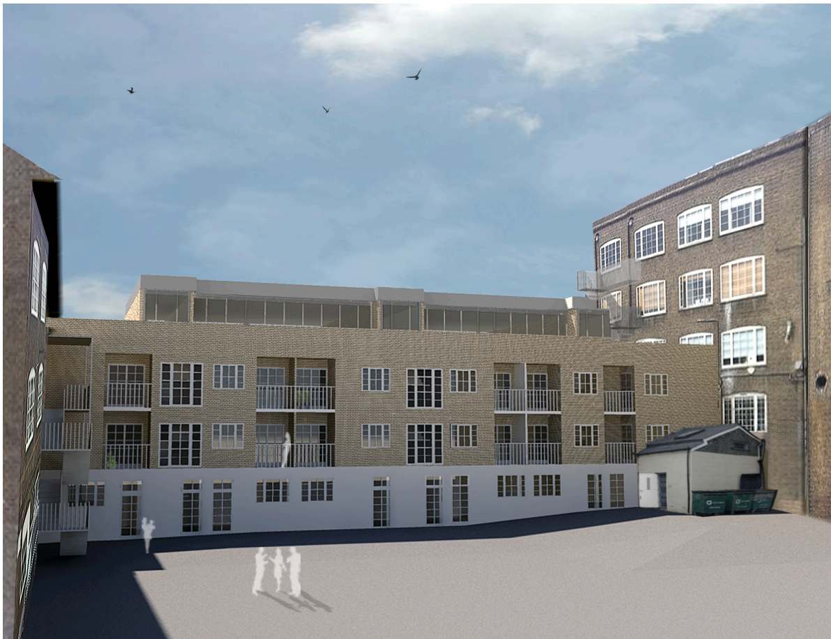
Front view 2