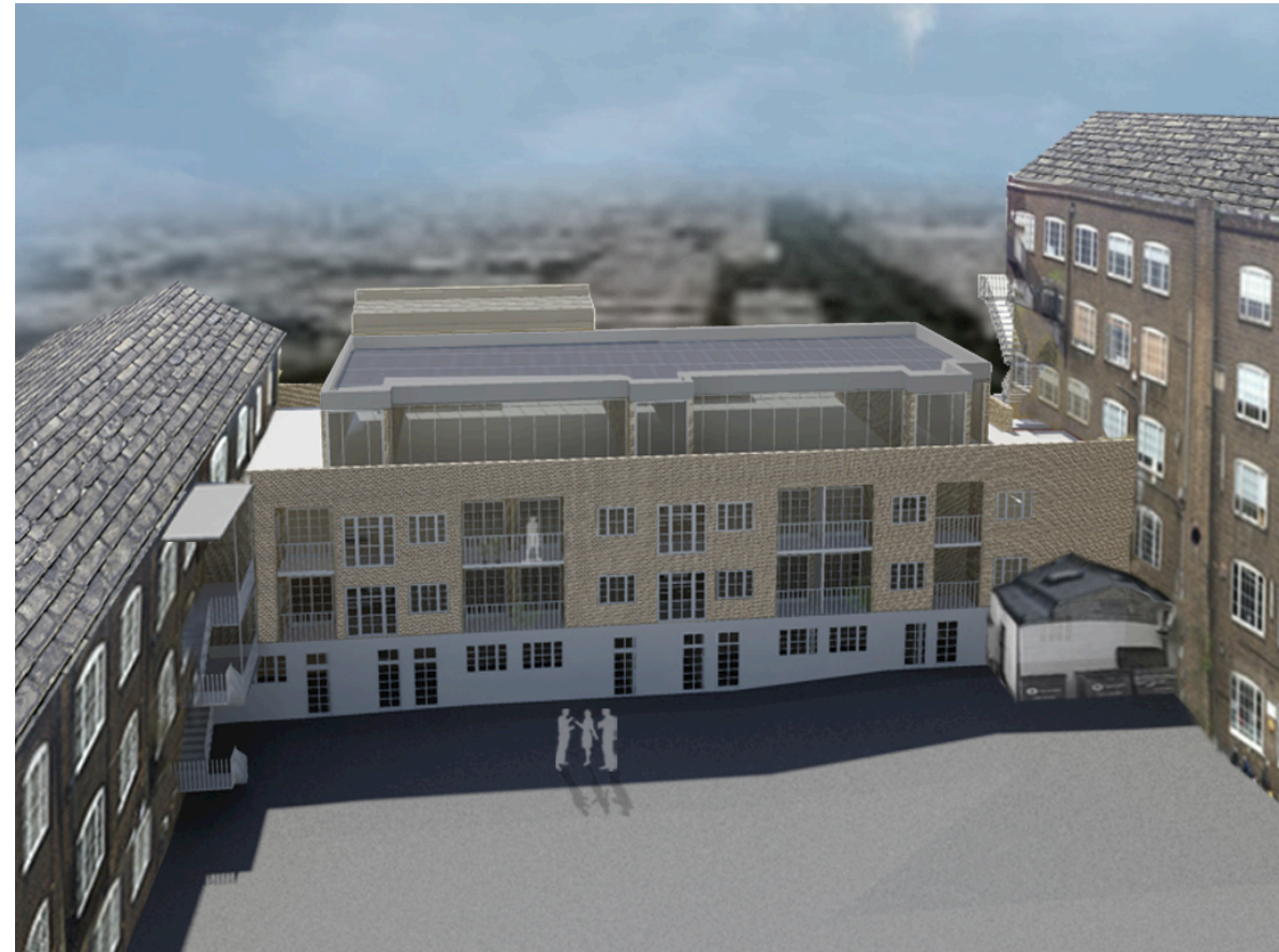
Front view 1