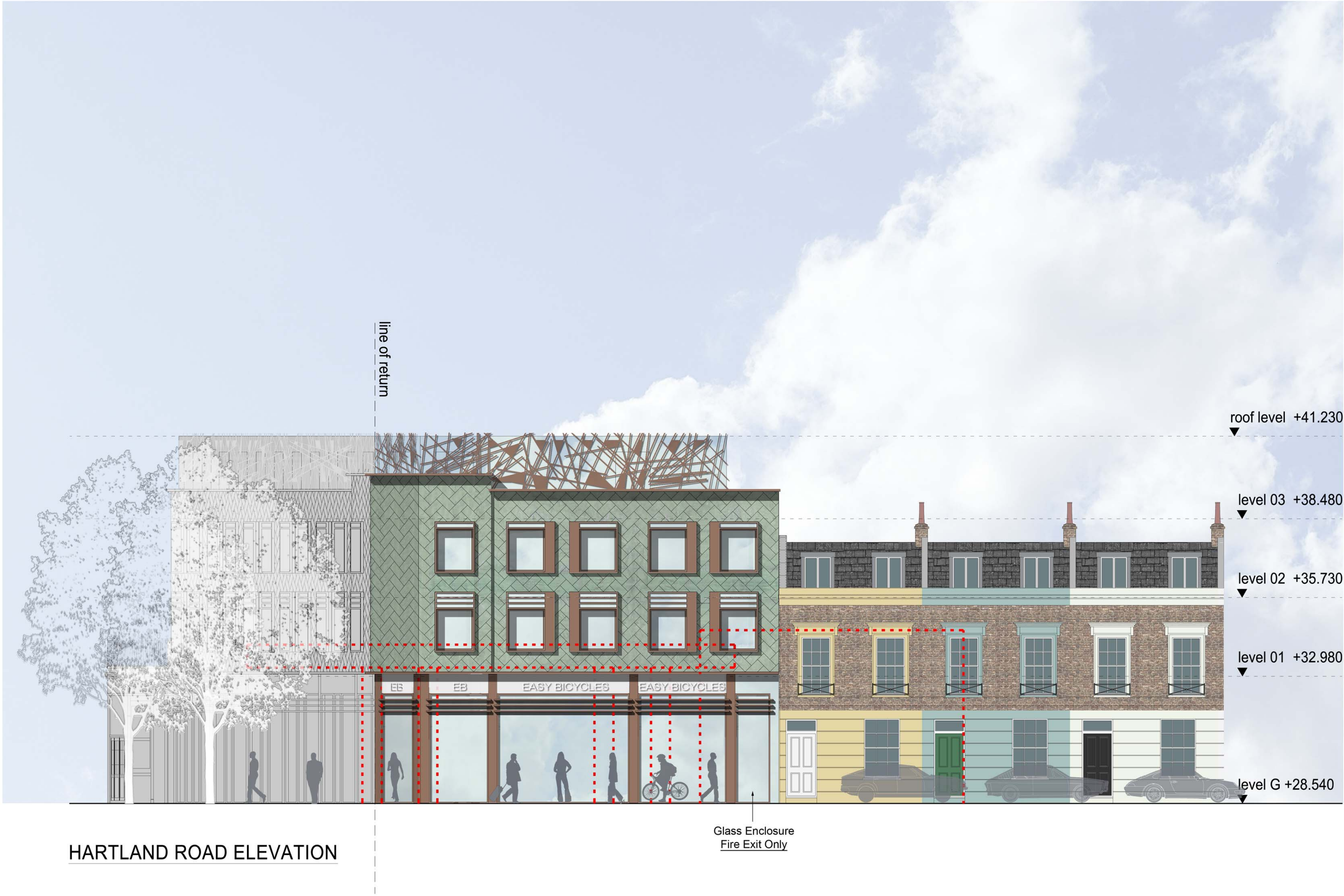
HARTLAND ROAD ELEVATION