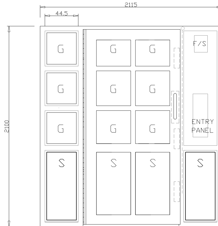
ELEVATION OF TYPICAL JANSEN SINGLE DOORSET/SCREEN DOOR HROI DRAWN OPENING IN AWAY FROM VIEWER

1No SINGLE DOORSET REQUIRED HROI AS DRAWN FOR 34-46 ST. NICHOLAS FRONT MANUFACTURE No