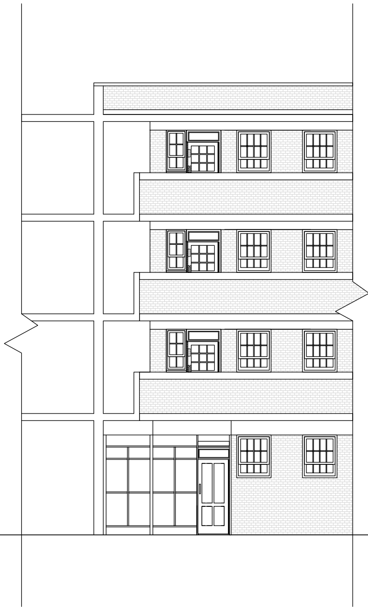
ST NICHOLAS 3-29 REAR ELEVATION