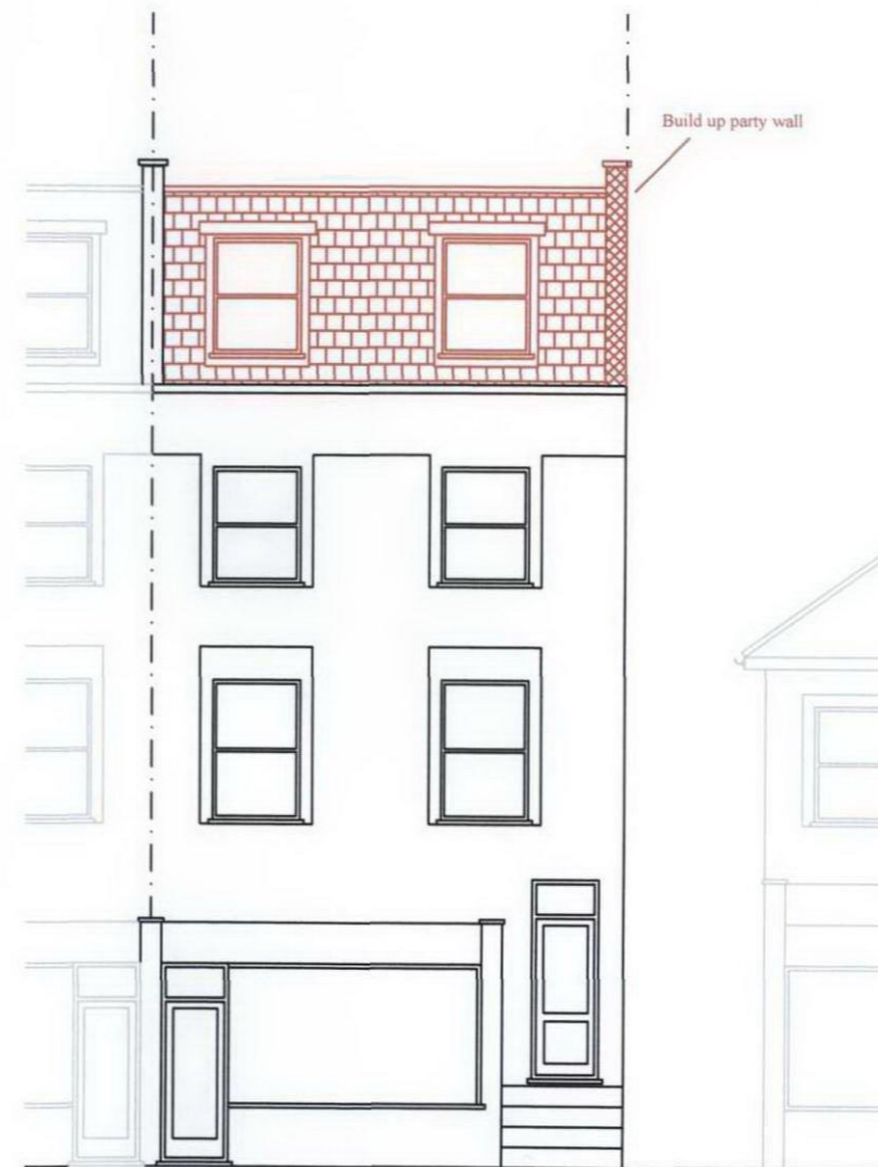
PROPOSED FRONT ELEVATION (EAST)