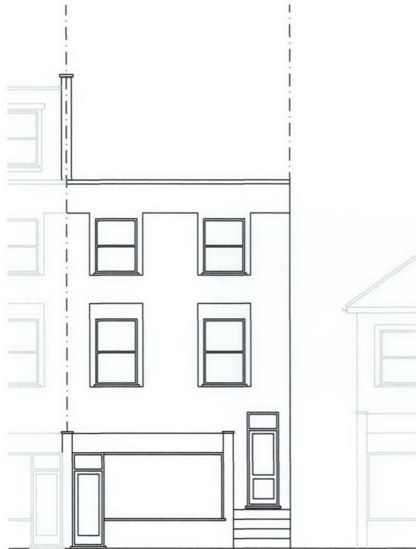
FRONT ELEVATION (EAST)