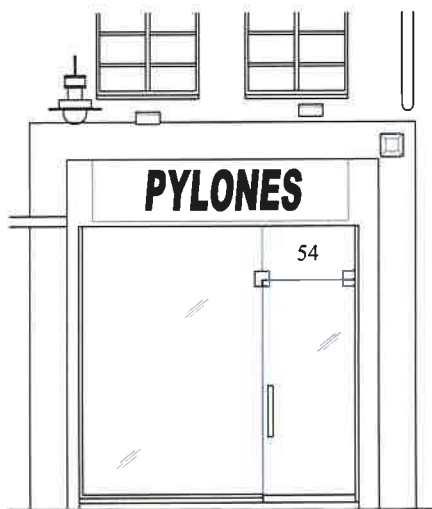
EXISTING ELEVATION @JUNE/2012