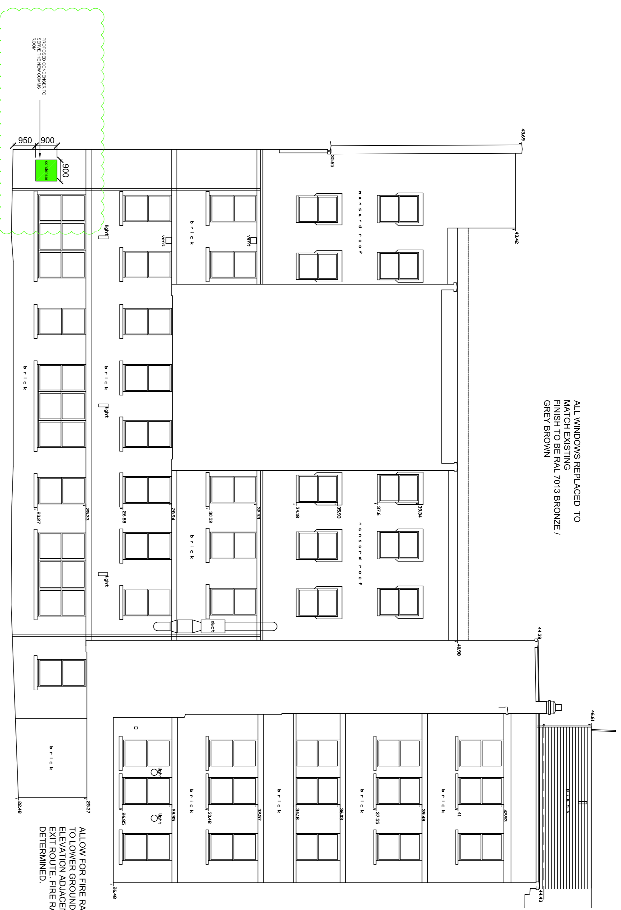
DATUM 20.00metres ELEVATION 6

ALL WINDOWS REPLACED TO MATCH EXISTING FINISH BE RAL 7013 BRONZE / GREY BROWN