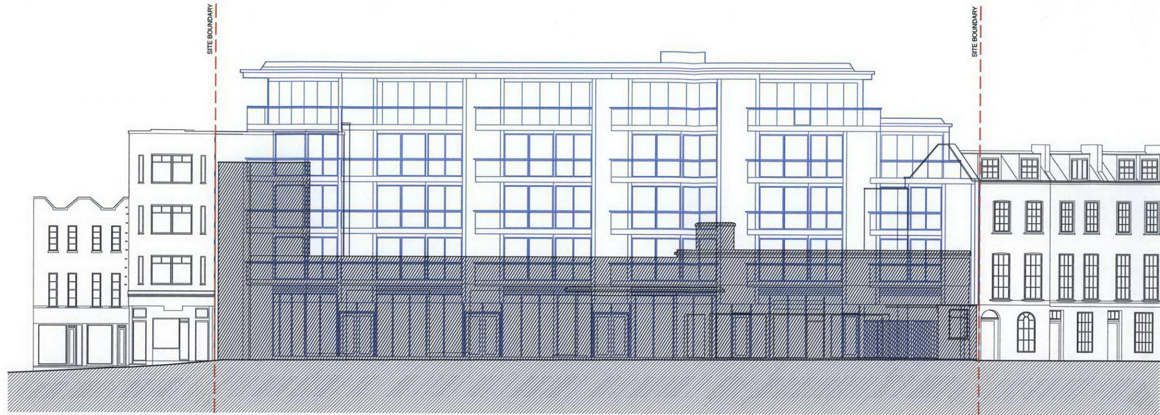
ELEVATION ALONG JUNCTION BETWEEN PARKWAY AND DELANCEY STREET