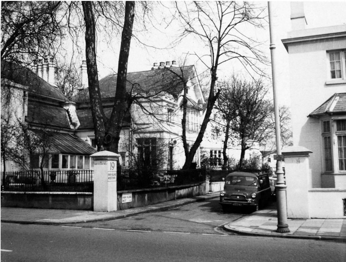
Corner of Albany Street and Park Village West showing corner post, wall and metal railing during second half of the twentieth century

HISTORICAL NOTE: Park Village East and West (qv) were first sketched out by John Nash in 1823 as developments of small independent houses at the edge of Regent's Park. They had great influence on the development of the Victorian middle-class suburb. Both villages originally backed onto the Cumberland Basin arm of the Regent's Canal, constructed 1813-16 to service Cumberland Market; filled in 1942-3. Park Village West is listed Grade II* on account of its innovation and completeness.