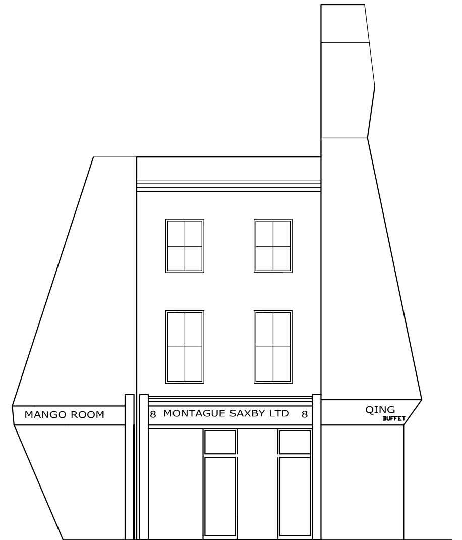
EXISTING FRONT ELEVATION OF BUILDING