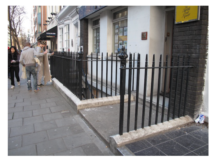
FRONT RAILINGS & LIGHTWELL AT 70 CHARLOTTE STREET