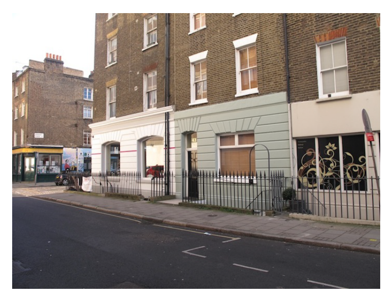
FRONT ELEVATION 43 TOTTENHAM STREET