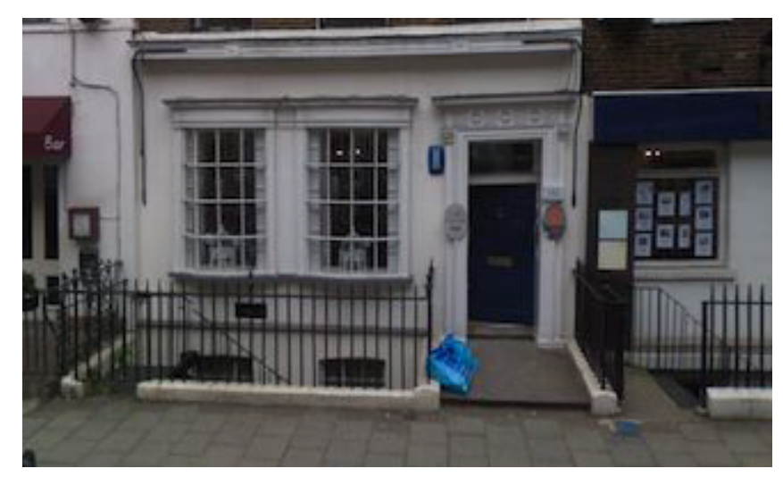
FRONT RAILINGS & LIGHTWELL AT 72 CHARLOTTE STREET