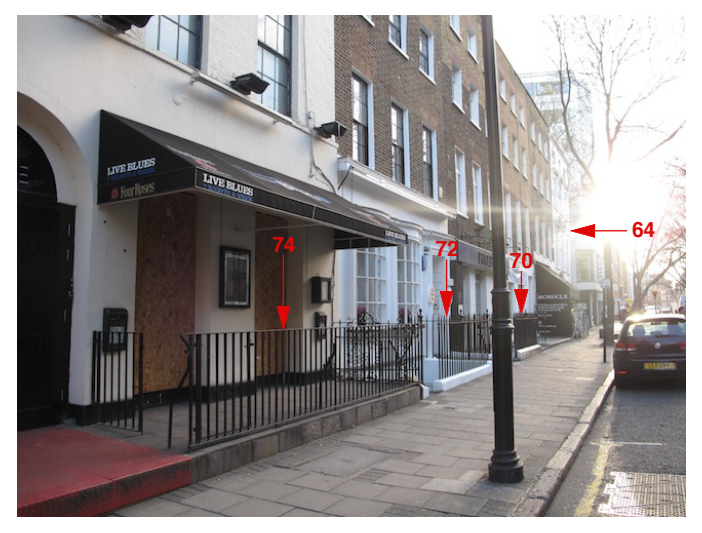
VIEW LOOKING DOWN CHARLOTTE STREET SHOWING FRONT RAILINGS AT NOS. 74, 72, 70