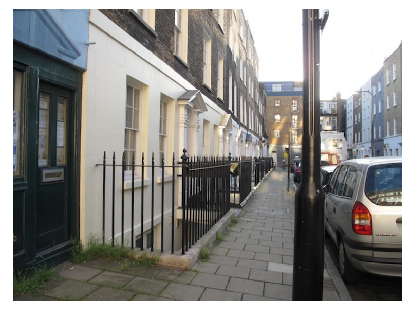
VIEW OF FRONT LIGHTWELLS AND RAILINGS AT GOODGE PLACE