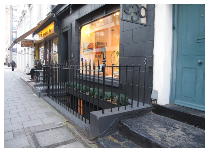
FRONT RAILINGS & LIGHTWELL AT 30 TOTTENHAM STREET