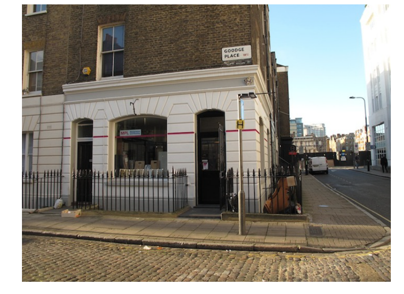
TOTTENHAM STREET & GOODGE PLACE SHOWING A BASEMENT LIGHTWELL WITH RAILINGS WRAPPING AROUND THE CORNER OF THE BUILDING