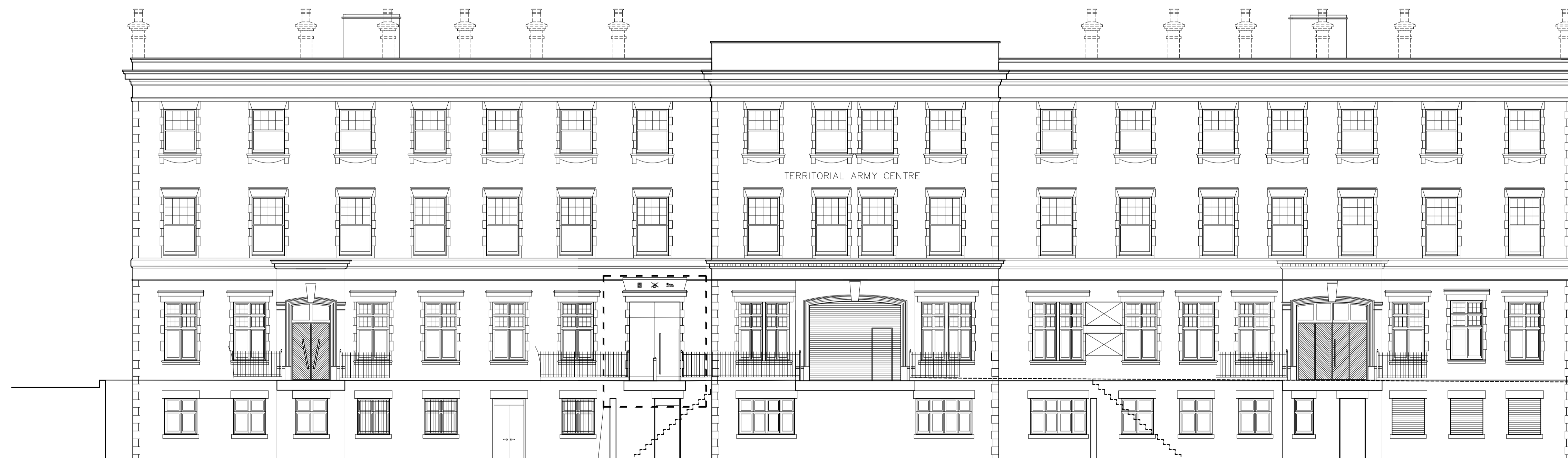
ELEVATION - HANDEL STREET 1:100 @ A1