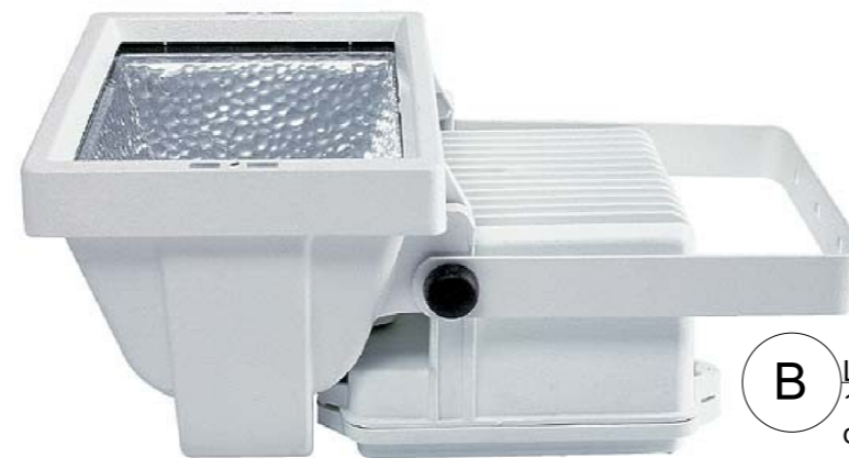
B LTS LIGHTING - Type HH - AWA 15003 150w grey metal halide luminaire with aluminium die cast body, wide beam angle reflector and fitted with shutter blades and side blades