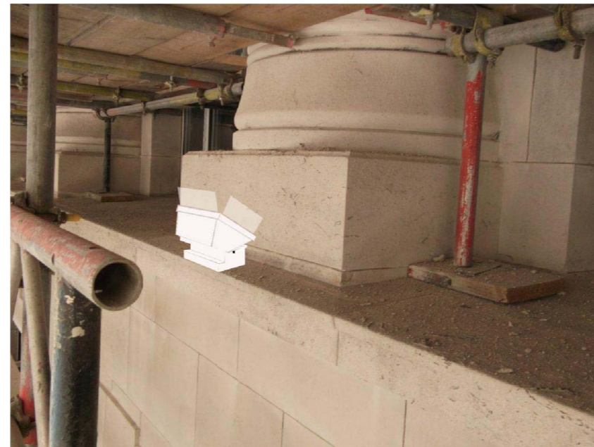
C Photomontage showing AWA 15003 halide luminaires lighting 4 main columns - 3rd floor