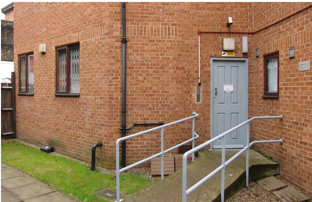
Office entrance (north elevation), with St Pancras Way beyond