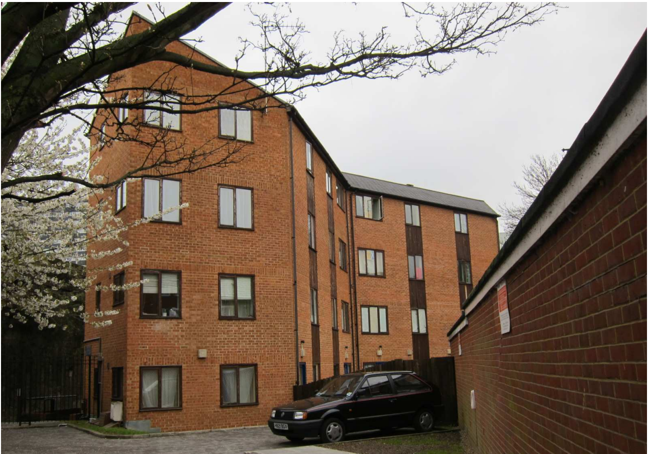
South and east elevations, viewed from Baynes Street