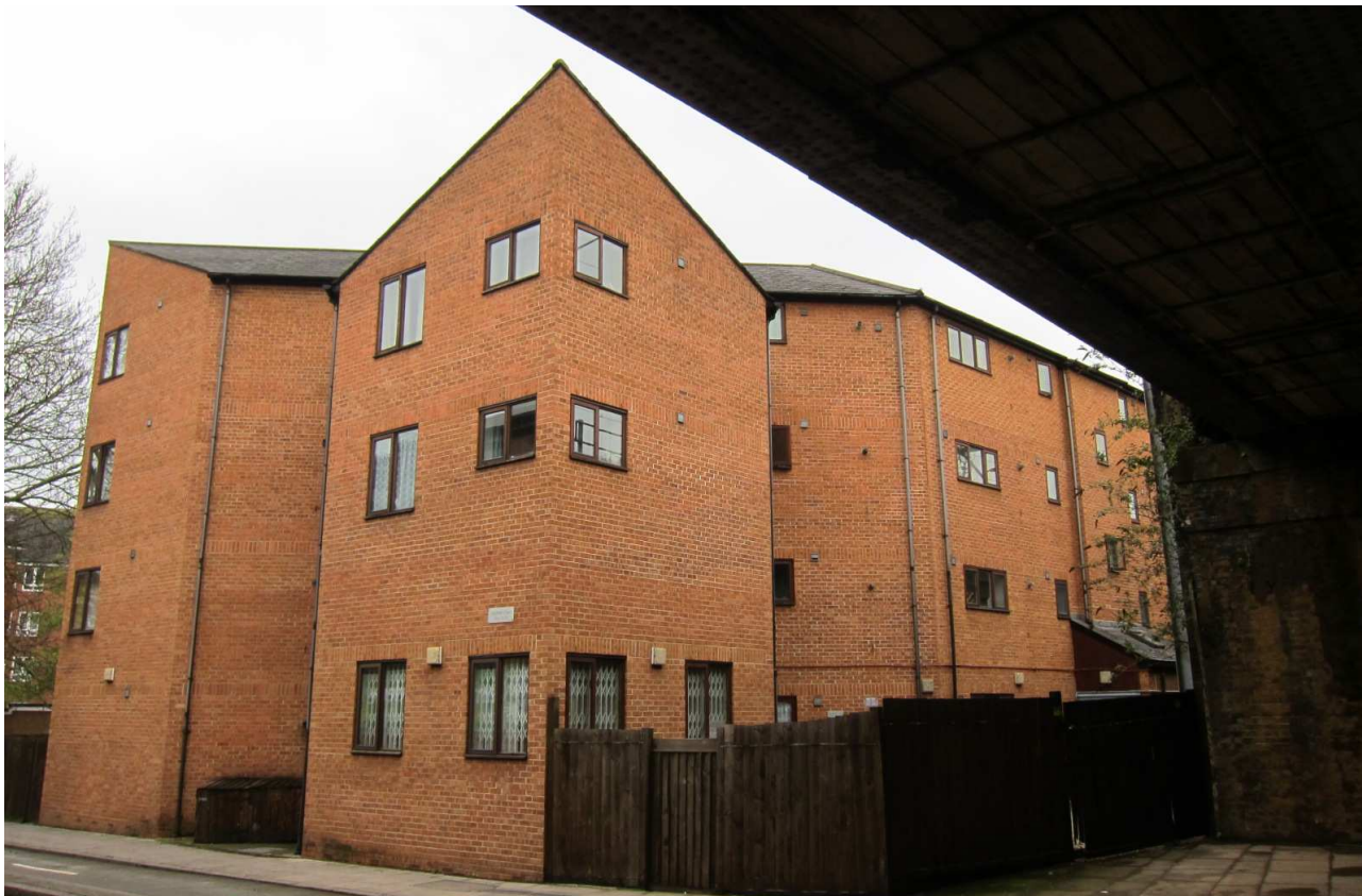
East and north elevations from St. Pancras Way