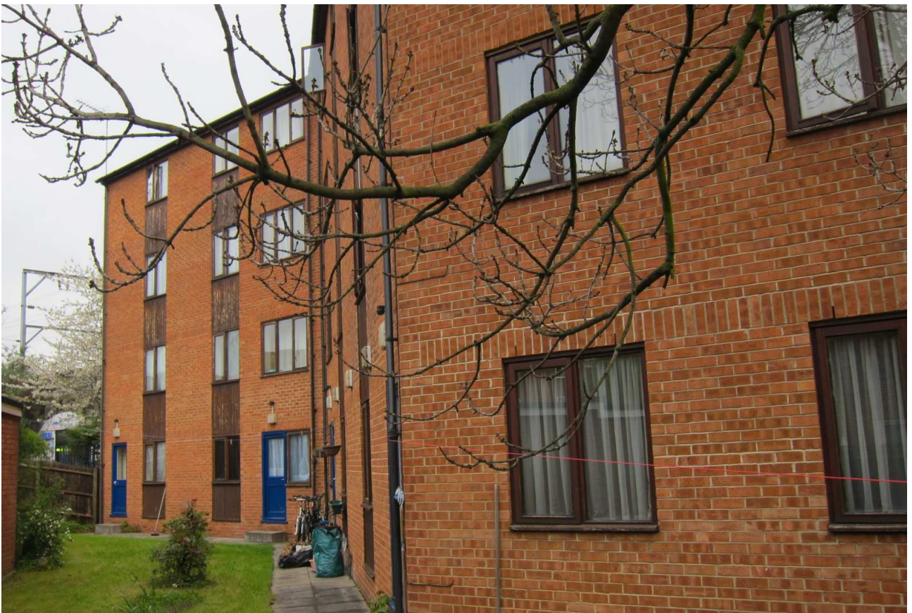
South elevation - detail