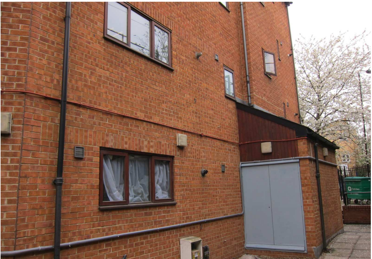
Entrance porch to north elevation, with Baynes Street beyond