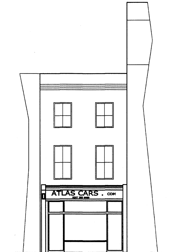
PROPOSED FRONT ELEVATION OF BUILDING