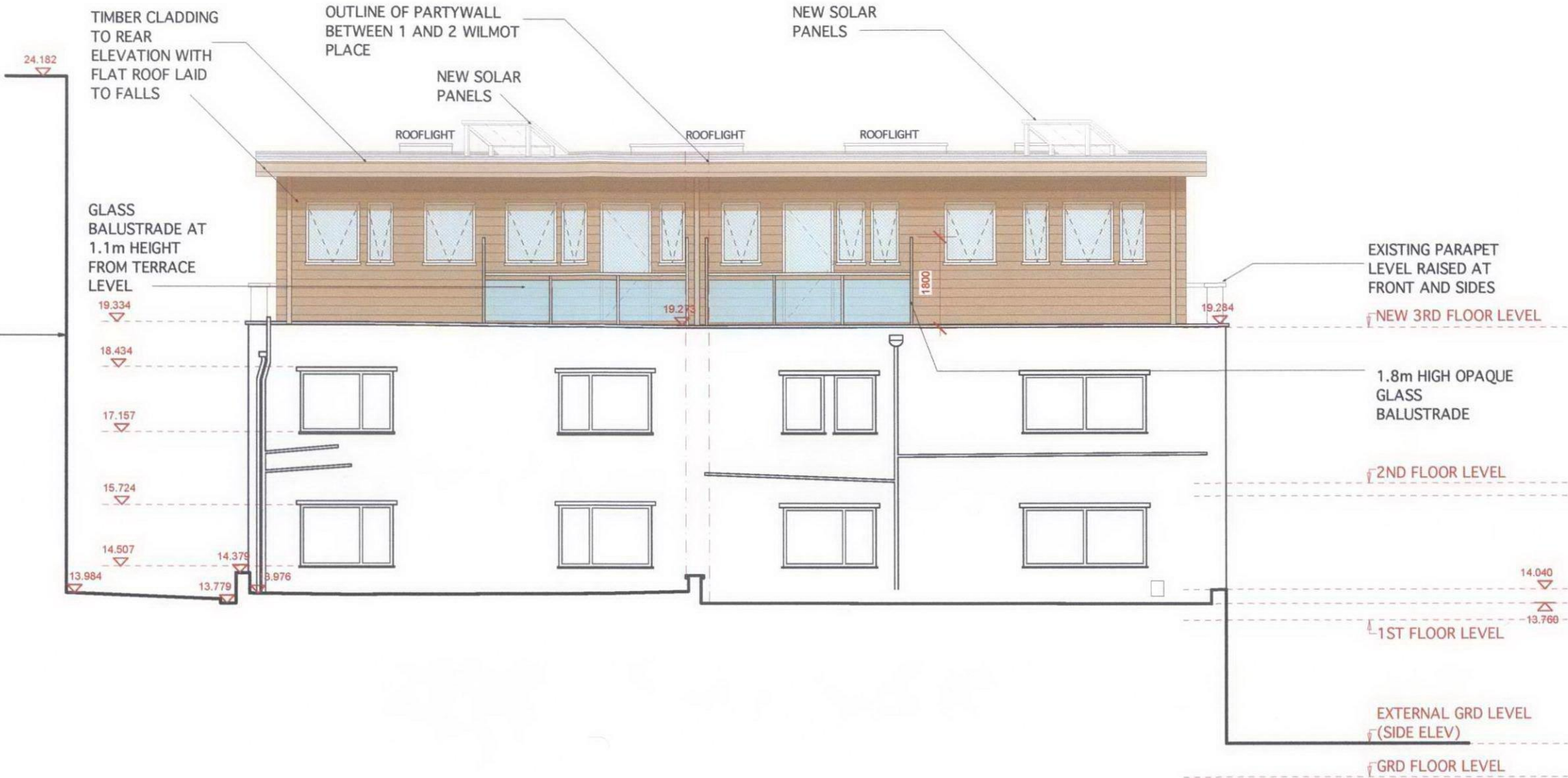
REAR ELEVATION - DATUM 5m