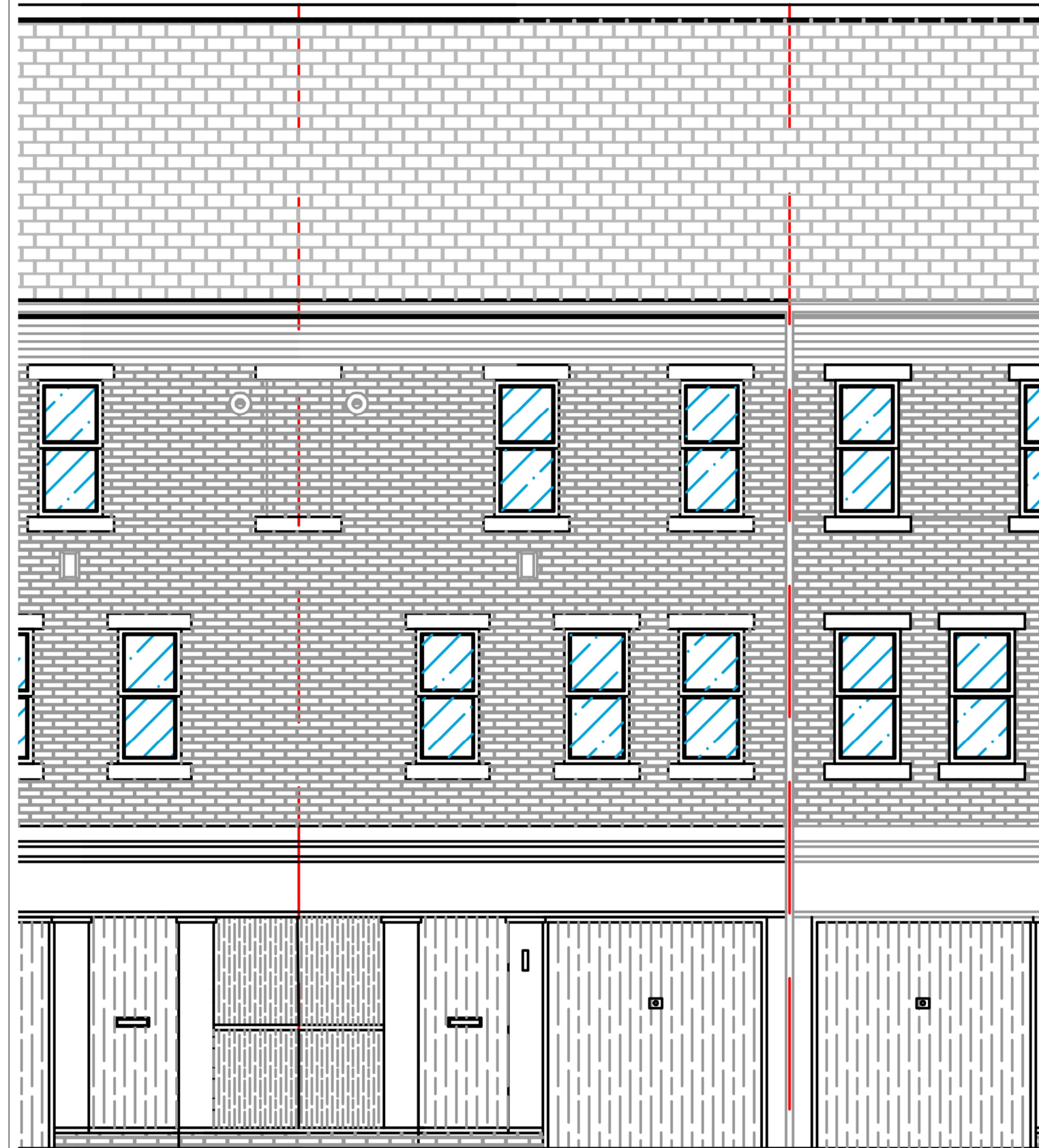
Existing front elevation