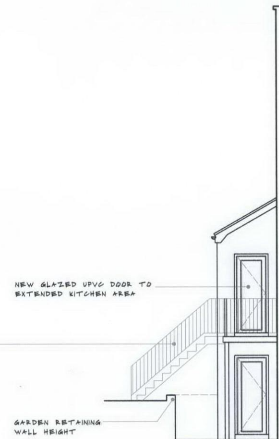
Proposed Side Elevation.