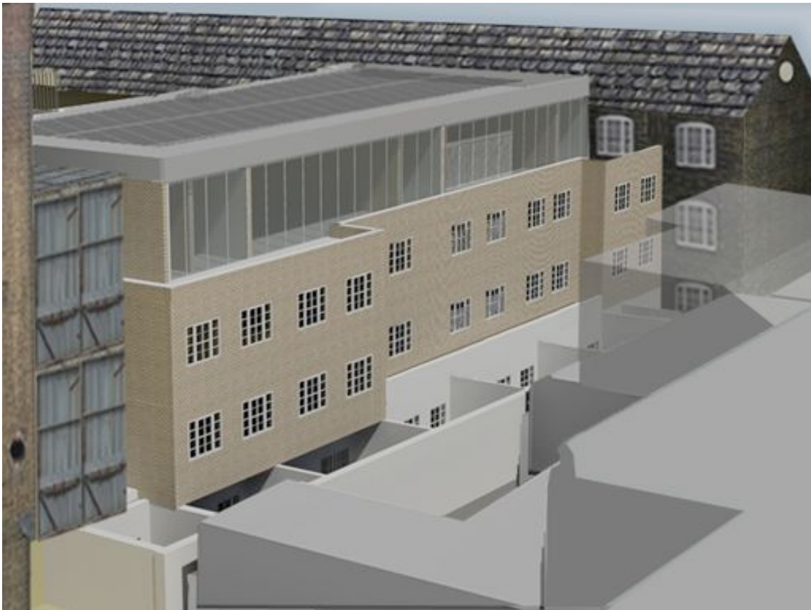
Rear view 2b 66A Chalk Farm Road shown transparent