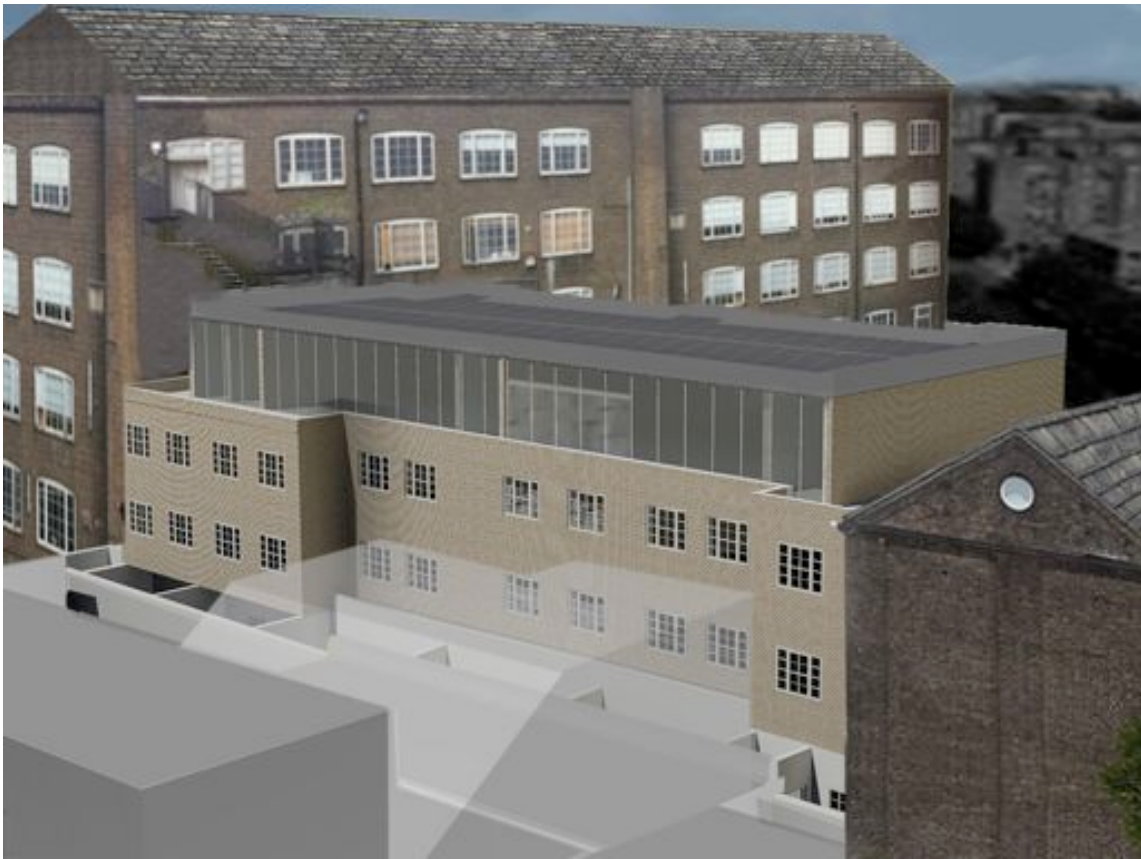
Rear view 1b 66A Chalk Farm Road shown transparent