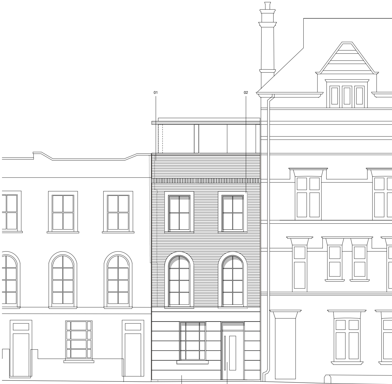
01 FRONT ELEVATION Scale : 1: 50