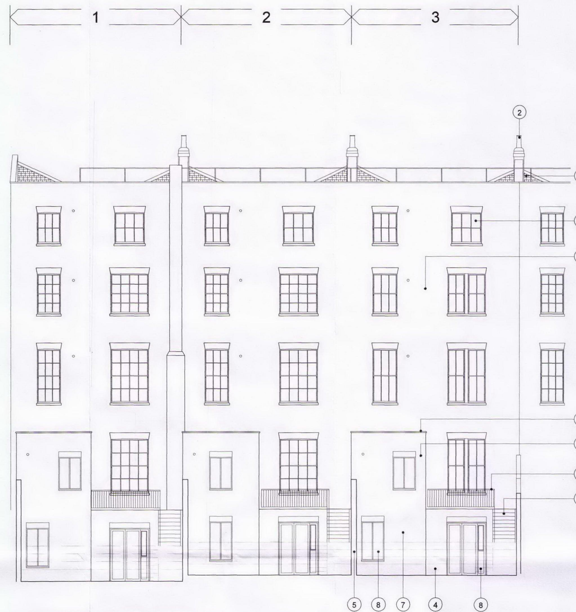
PROPOSED REAR ELEVATION 1-3 BEDFORD PLACE