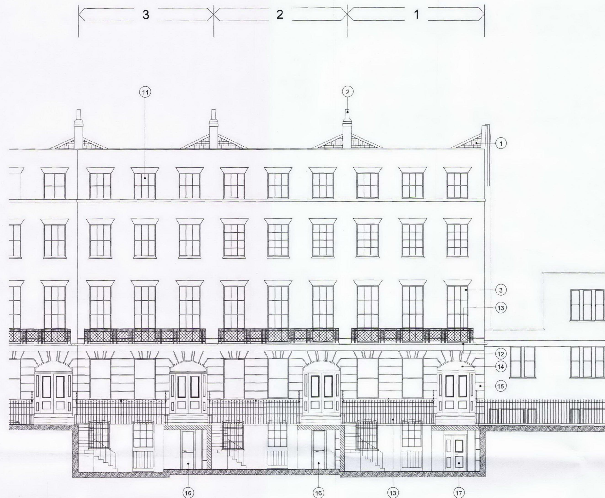
PROPOSED STREET ELEVATION 1-3 BEDFORD PLACE