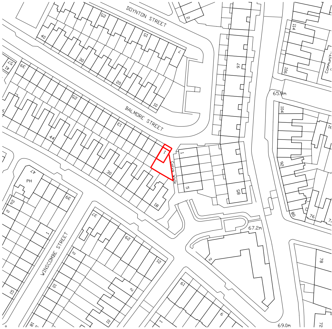
01 LOCATION PLAN SCALE 1:1250 @ A3

Do not scale from this drawing: work from noted dimensions only. All dimensions to be checked on site. These drawings are initial sketch layouts to establish spatial options only. They are subject to planning, building control and other statutory requirements.