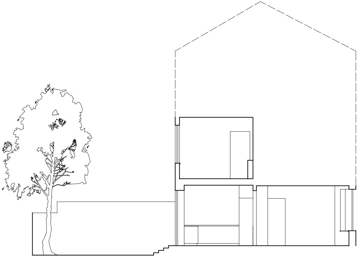
02 EXISTING SECTION SCALE 1:100 @ A3