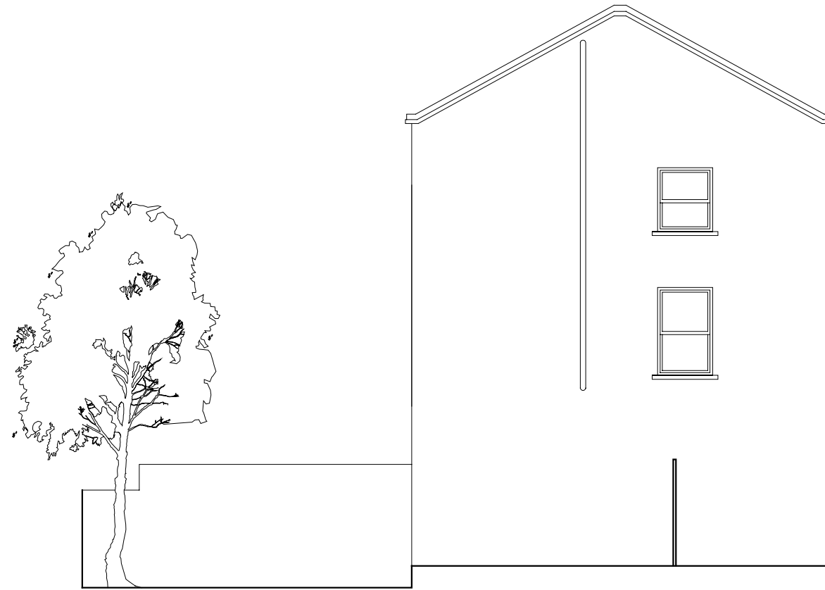
03 EXISTING SIDE ELEVATION SCALE 1:100 @ A3