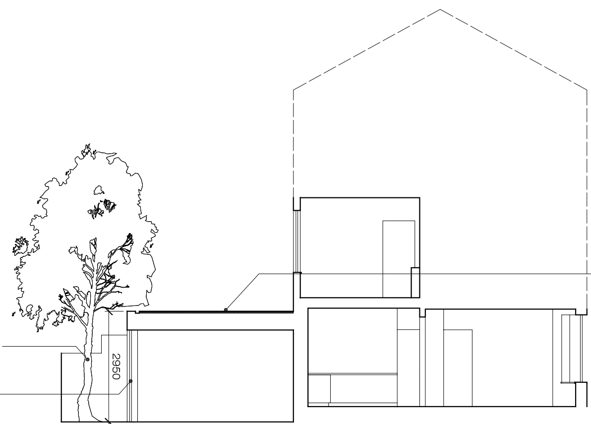
02 PROPOSED SECTION SCALE 1:100 @ A3