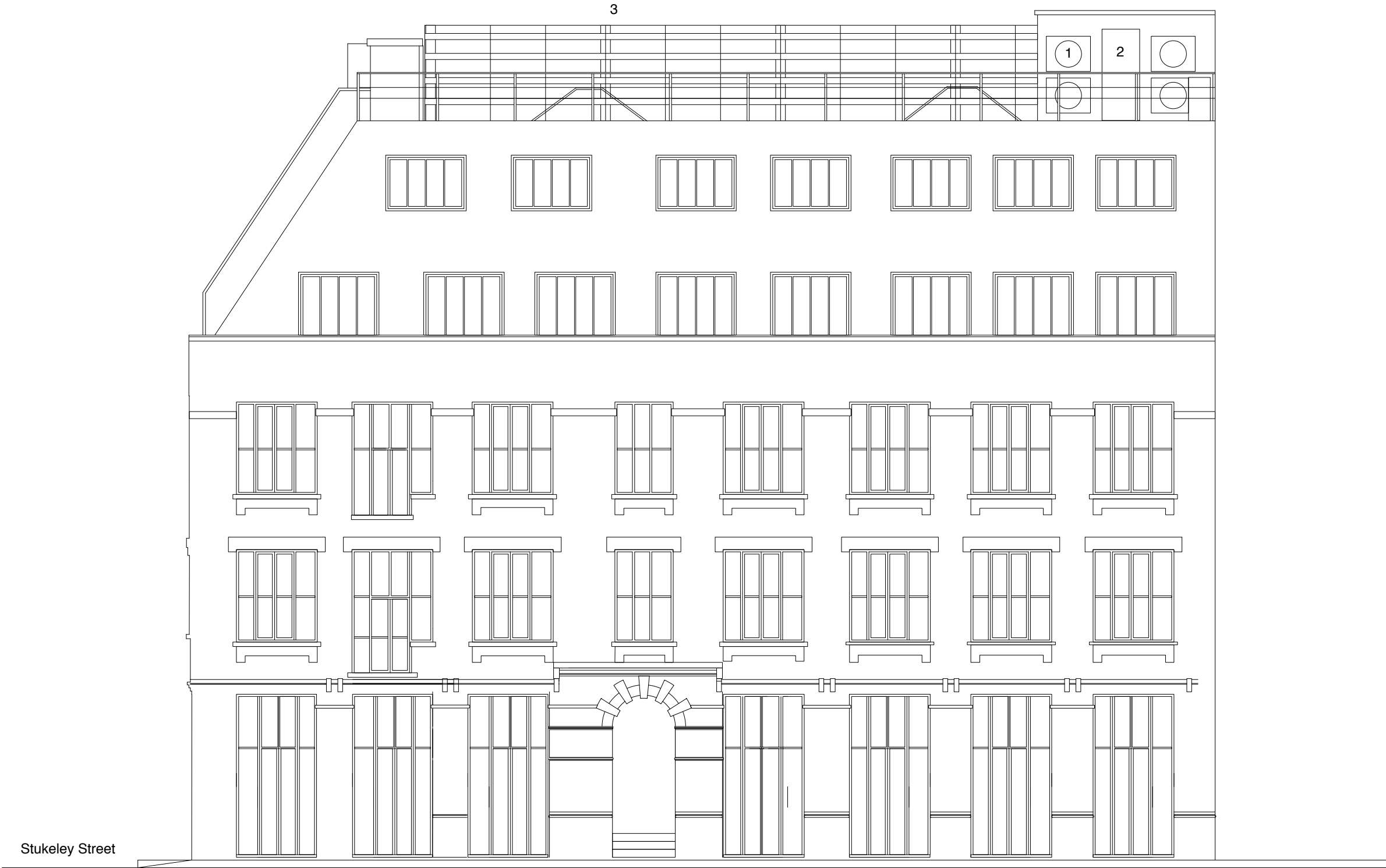
Proposed North West elevation

HUGHBROUGHTONARCHITECTS 41a Beavor Lane London W6 9BL T 020 8735 9959 F 020 8563 3891 E info@hbarchitects.co.uk © Hugh Broughton Architects Ltd