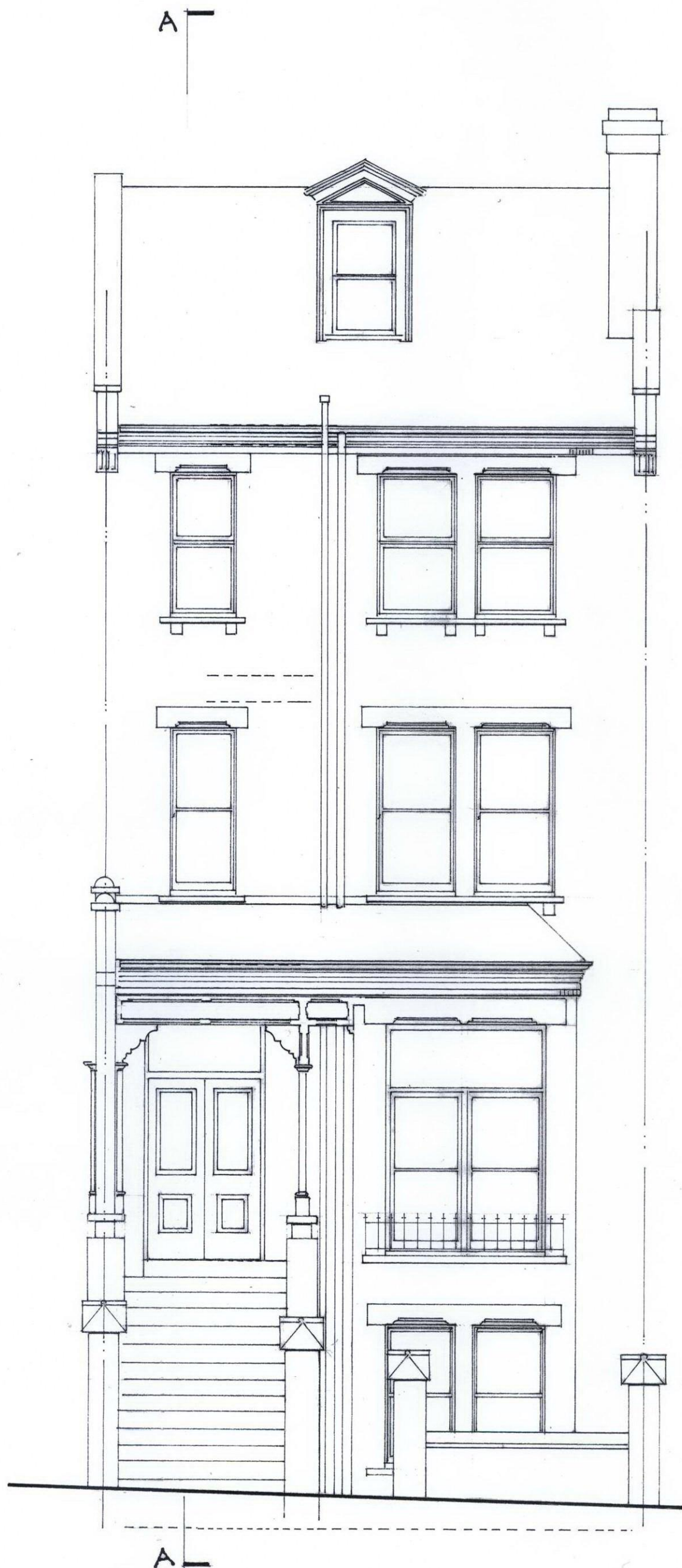
SOUTH ELEVATION, FRONT, EXISTING 1:50