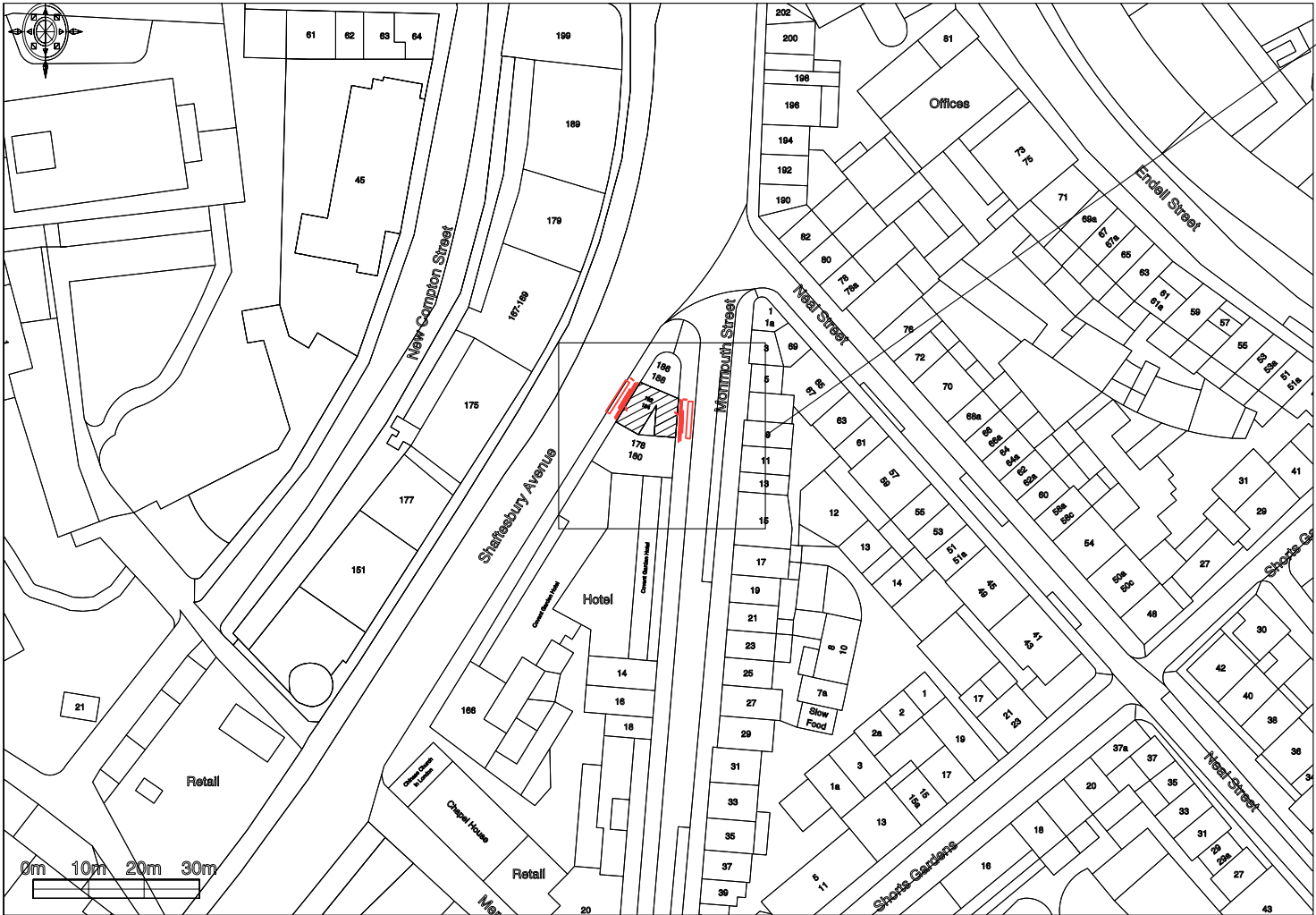
Site Plan Scale 1:1250