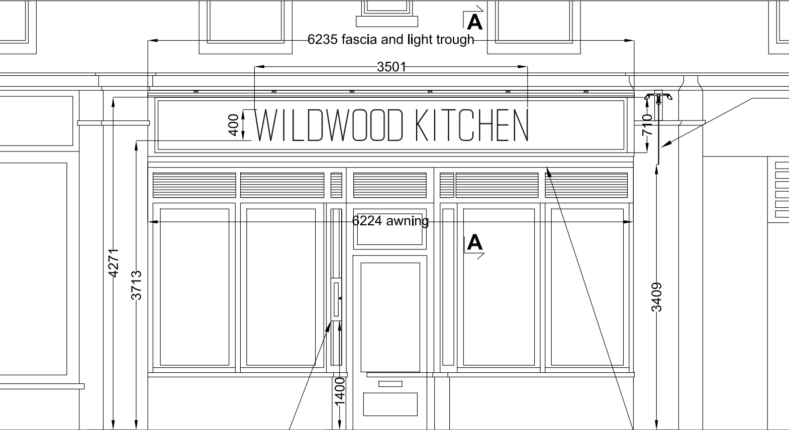
Monmouth Street Elevation Scale 1:50