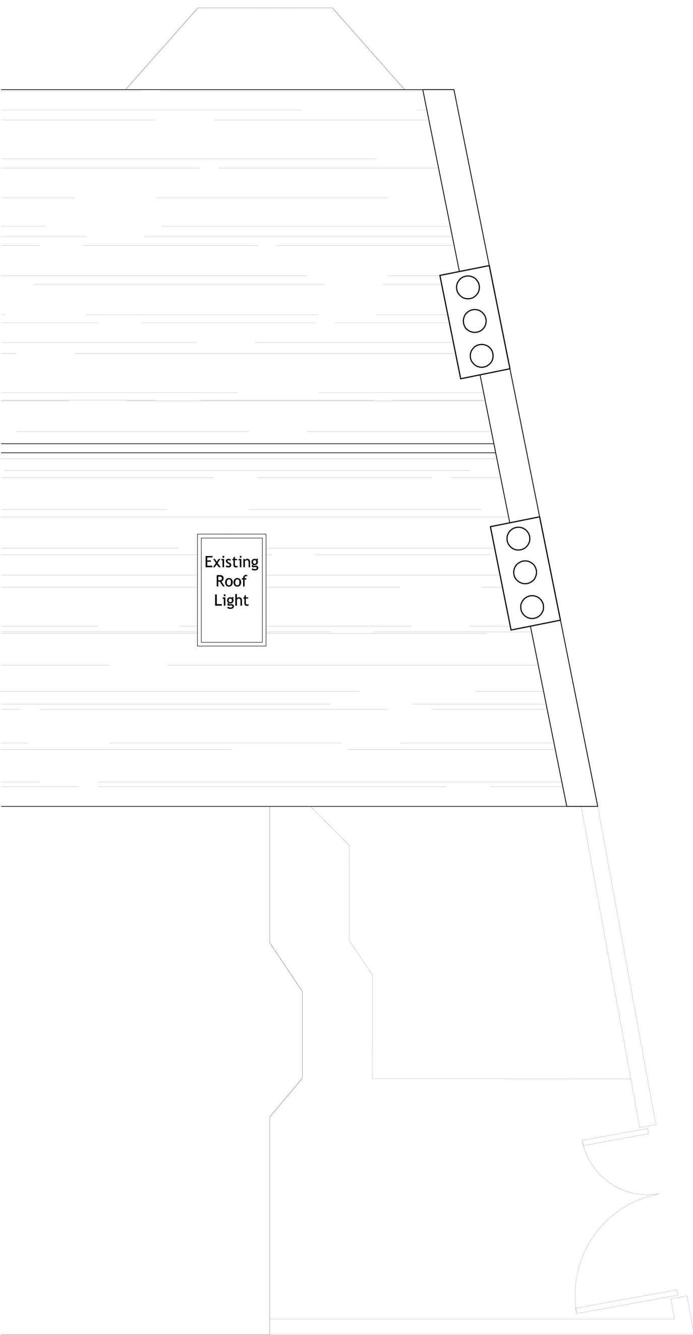
Roof Plan: As Existing (at current work stage)