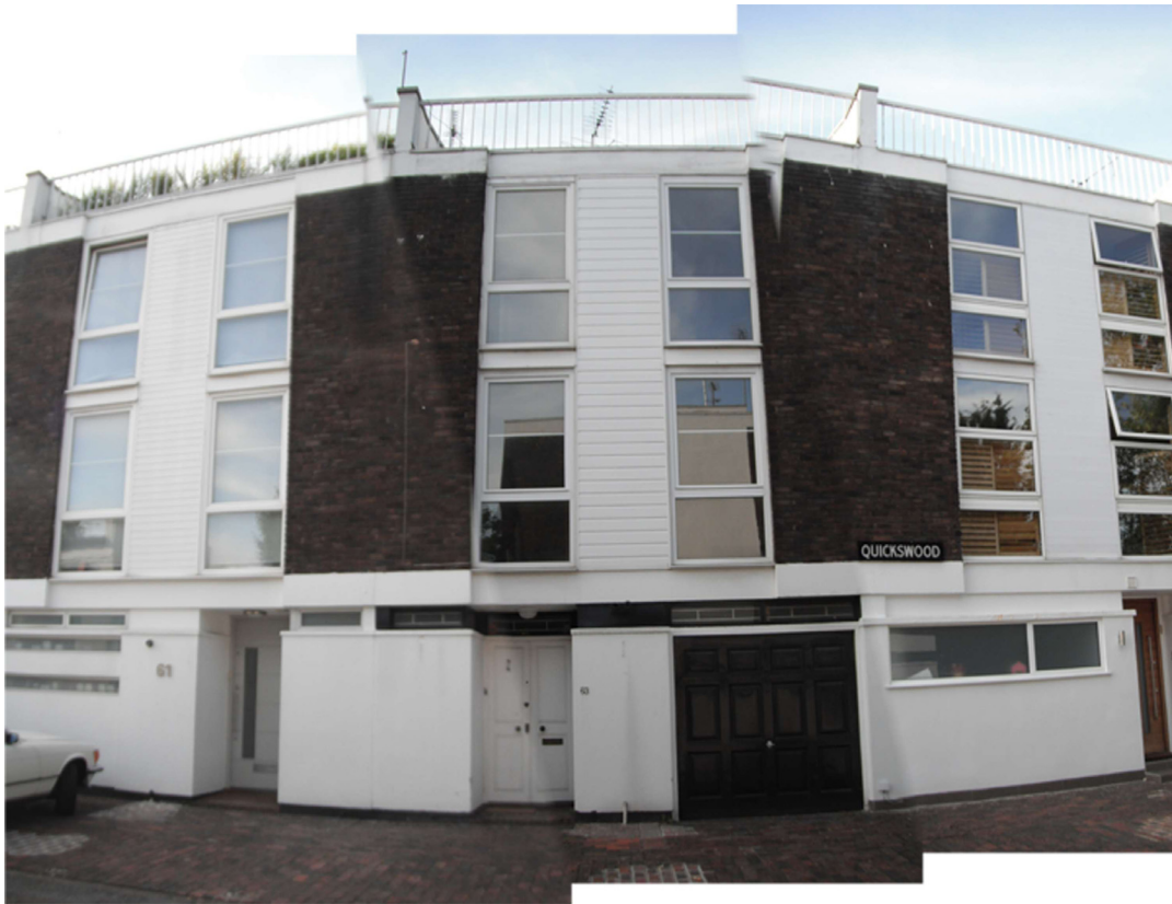
Front Elevation - Existing