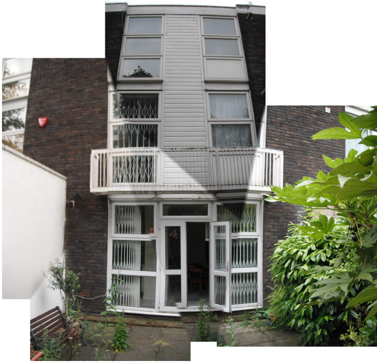
Rear Elevation - Existing

Copyright Burd Haward Architects. Unless otherwise stated, this drawing is for information only. Do not scale from this drawing. All dimensions to be checked on site.