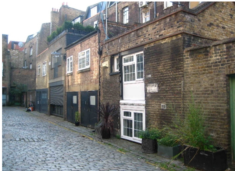
Figure 5 Existing Street scene of Warren Mews