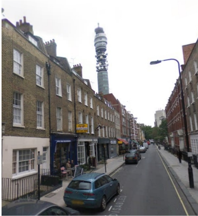
Figure 2 existing street scene of Cleveland Street