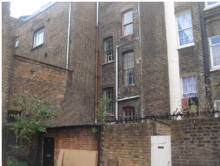
Figure 3 Rear Elevation of No 108 Cleveland Street