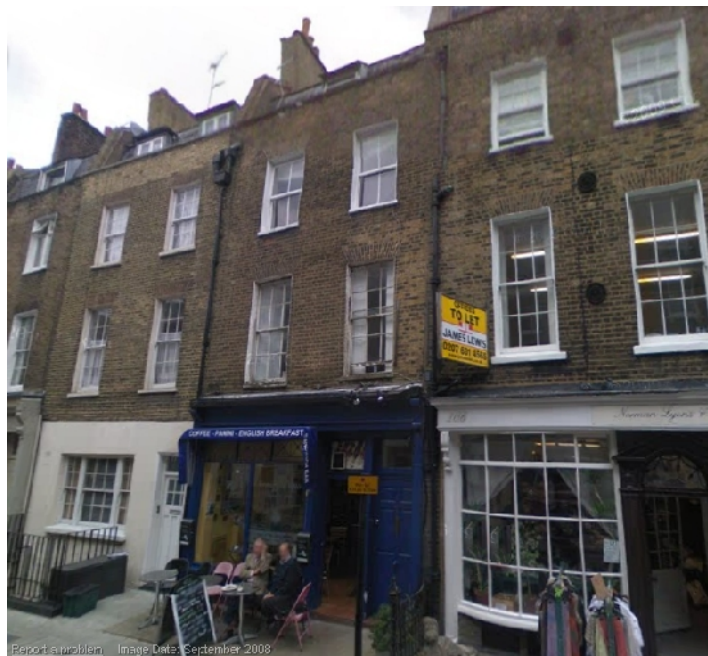
Figure 1 Front Elevation of 108 Cleveland St, seen in centre of the image