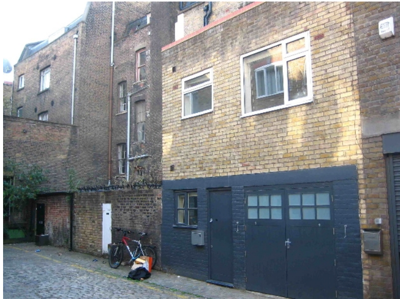
Figure 4 Rear elevations of No 108-112 Cleveland Street, forming Warren Mews