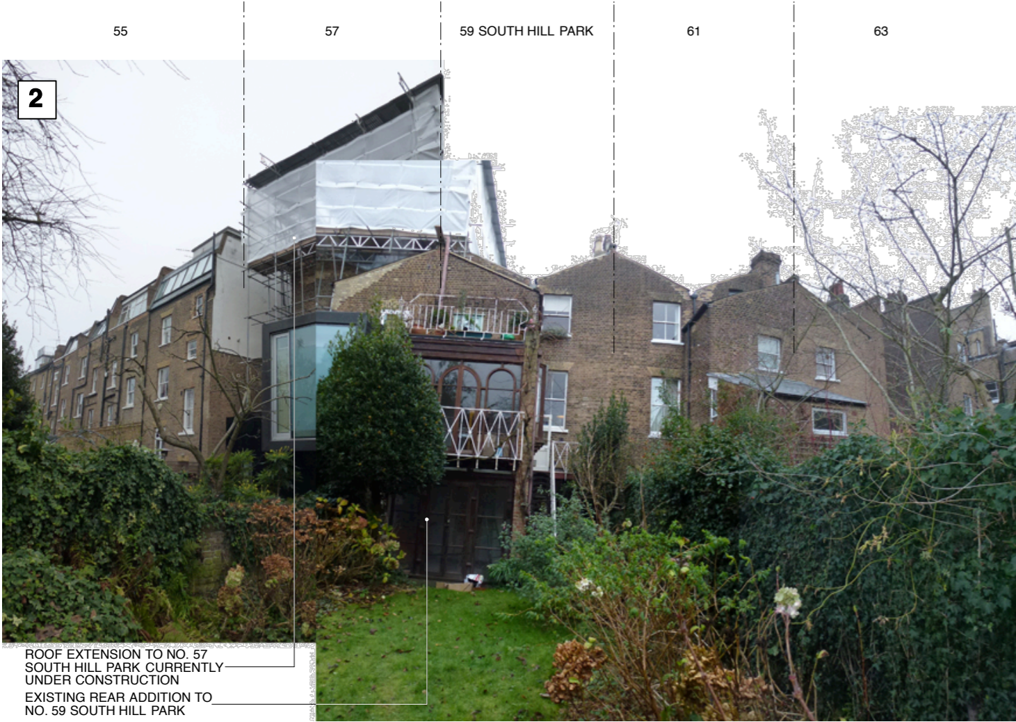
ROOF EXTENSION TO NO. 57 SOUTH HILL PARK CURRENTLY UNDER CONSTRUCTION EXISTING REAR ADDITION TO NO. 59 SOUTH HILL PARK

19/04/12 ISSUE TO PLANNING FOR COMMENT 30/07/12 ISSUE TO PLANNING FOR APPROVAL