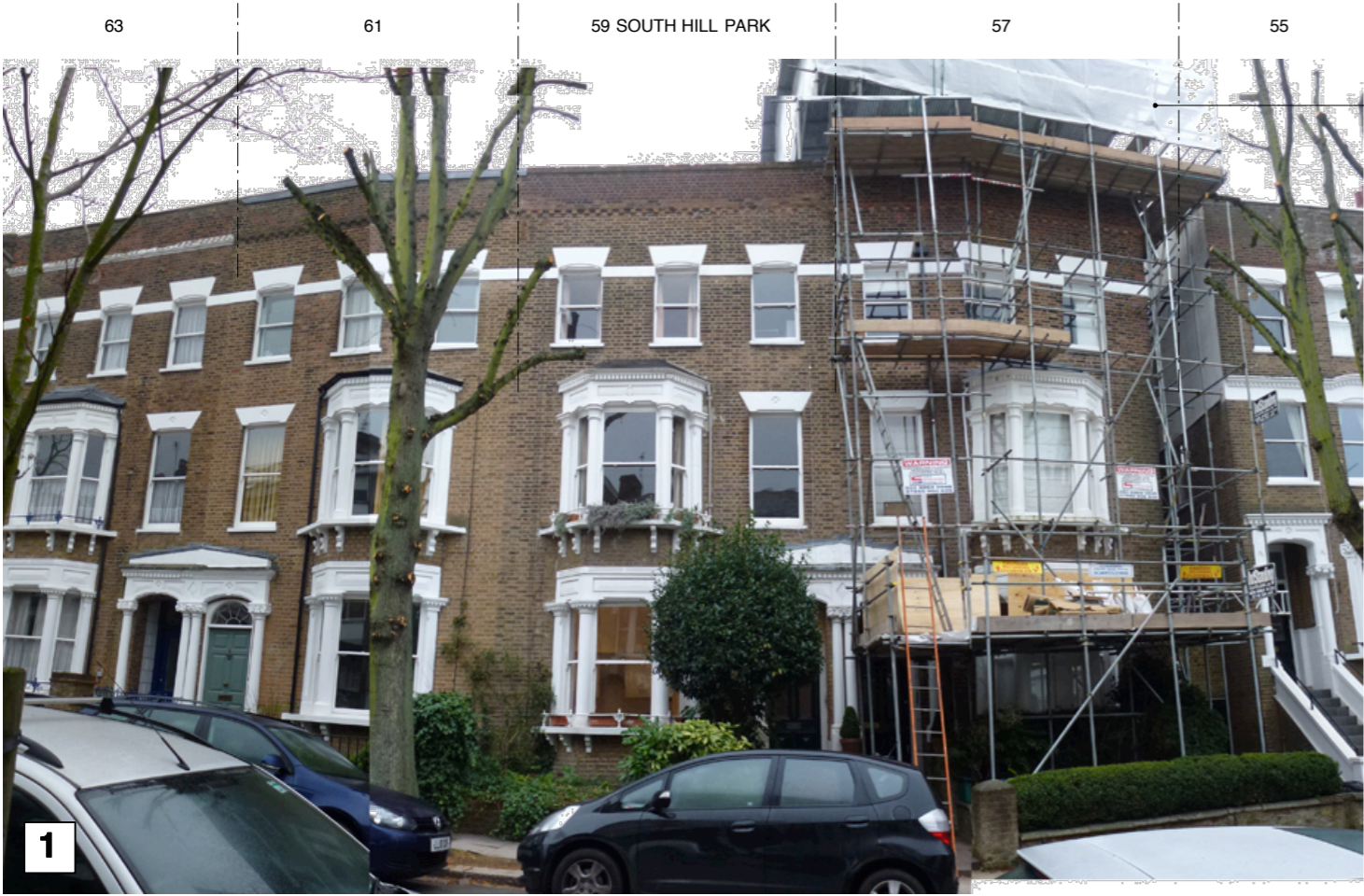
ROOF EXTENSION TO NO. 57 SOUTH HILL PARK CURRENTLY UNDER CONSTRUCTION