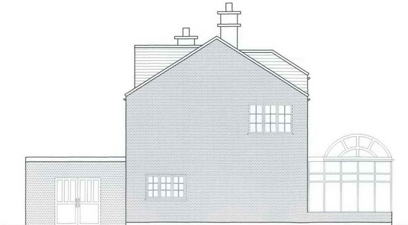
EXISTING SIDE ELEVATION-2

PARTY WALL NOTICES: PLEASE NOTE THAT BEFORE BUILDING WORKS COMMENCES IT IS THE RESPONSIBILITY OF BUILDER OR OWNER TO SERVE PARTY WALL NOTICES TO ALL NEIGHBOURS