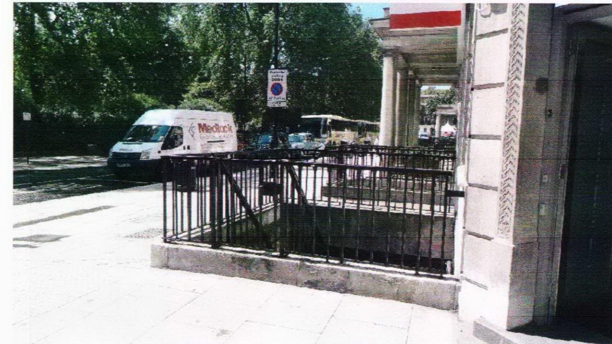
ELEVATION B - FRONT RAILING