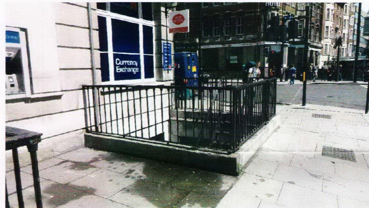
ELEVATION C - REAR RAILING