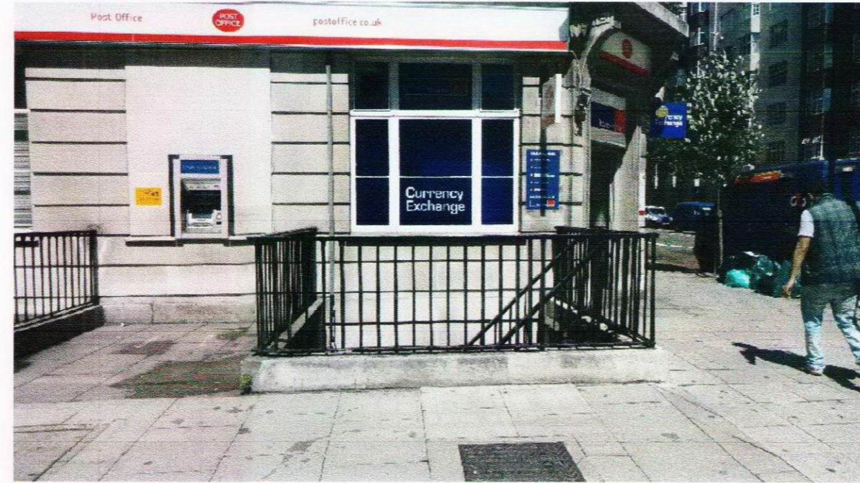
ELEVATION A - SIDE RAILING