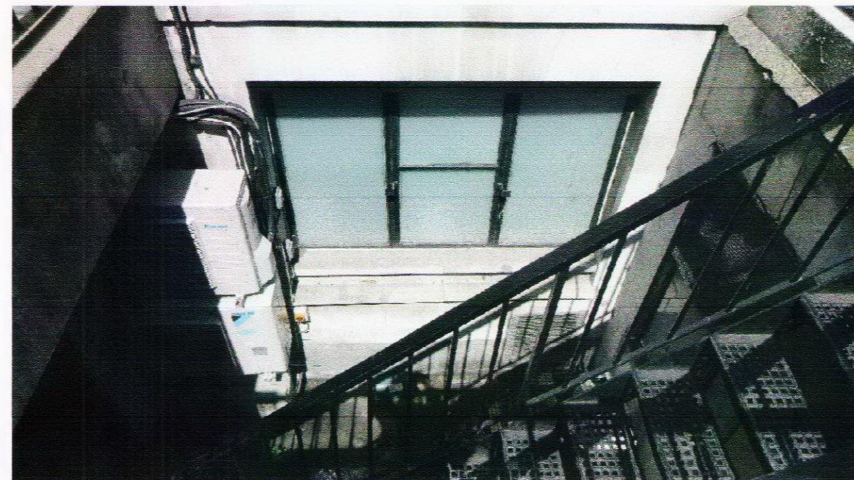
ELEVATION D - STAIRWELL