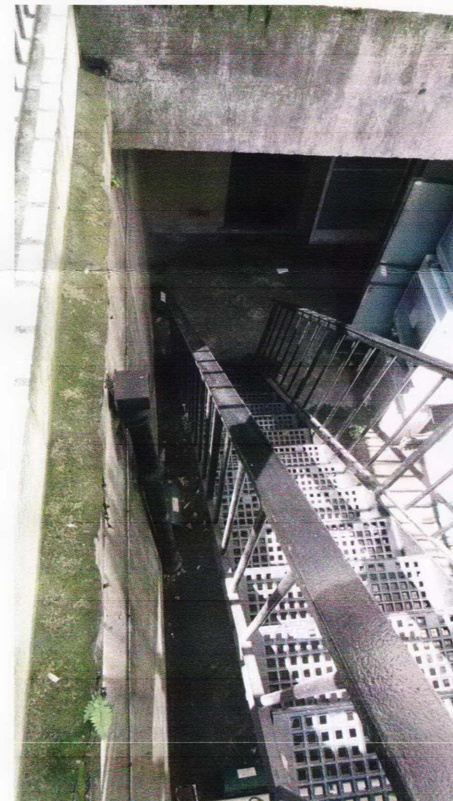
ELEVATION E - STAIRWELL

© Copyright Copyright of this drawing belongs to & is vested in TDA INTERIORS SOUTH LTD and may not be reproduced or distributed in any way or for any purpose without written consent by TDA INTERIORS SOUTH LIMITED. Any persons, firm or company unlawfully reproducing or distributing this drawing or in anyway infringing the copyright therein will be prosecuted. This document is the property of TDA INTERIORS SOUTH LIMITED. Copyright is reserved by them, and the drawing is issued on the condition that it is not copied, reproduced or retained by, nor disclosed to any unauthorised person, either wholly or in part, without the consent in writing from TDA INTERIORS SOUTH LIMITED. All dimensions to be checked by contractor on site before commencement of works. Do not scale from this drawing. Any discrepancies are to be notified to the Project Manager immediately.