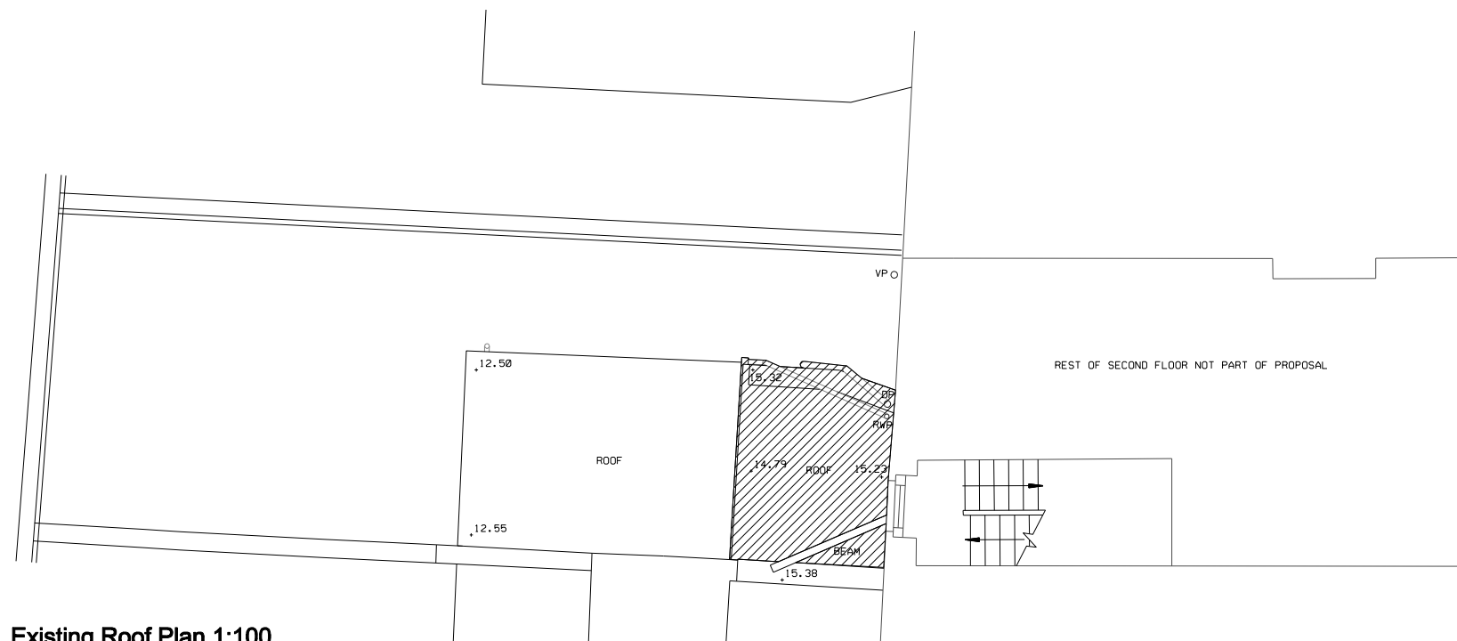
Existing Roof Plan 1:100