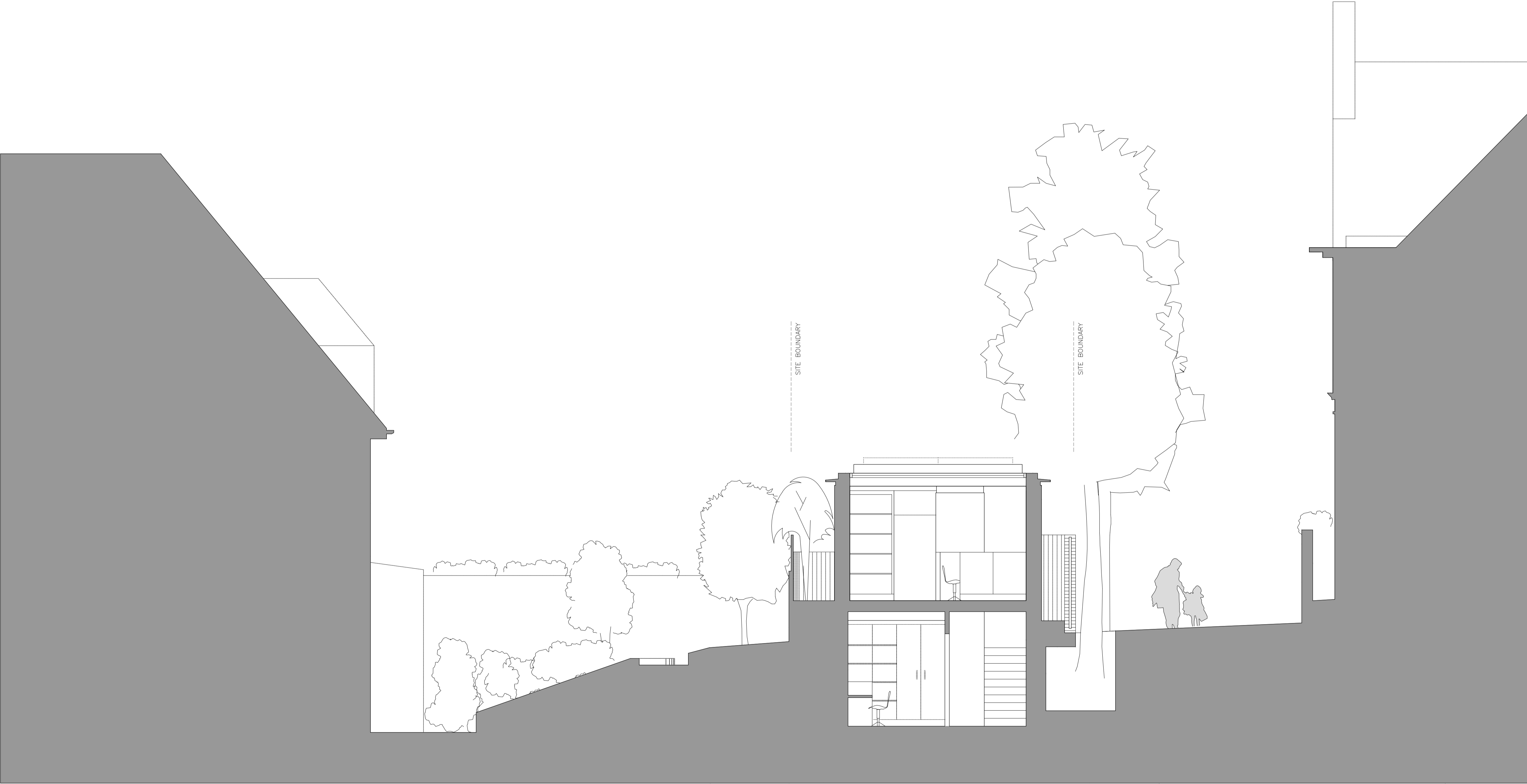
Section C-C' 90.00m AOD