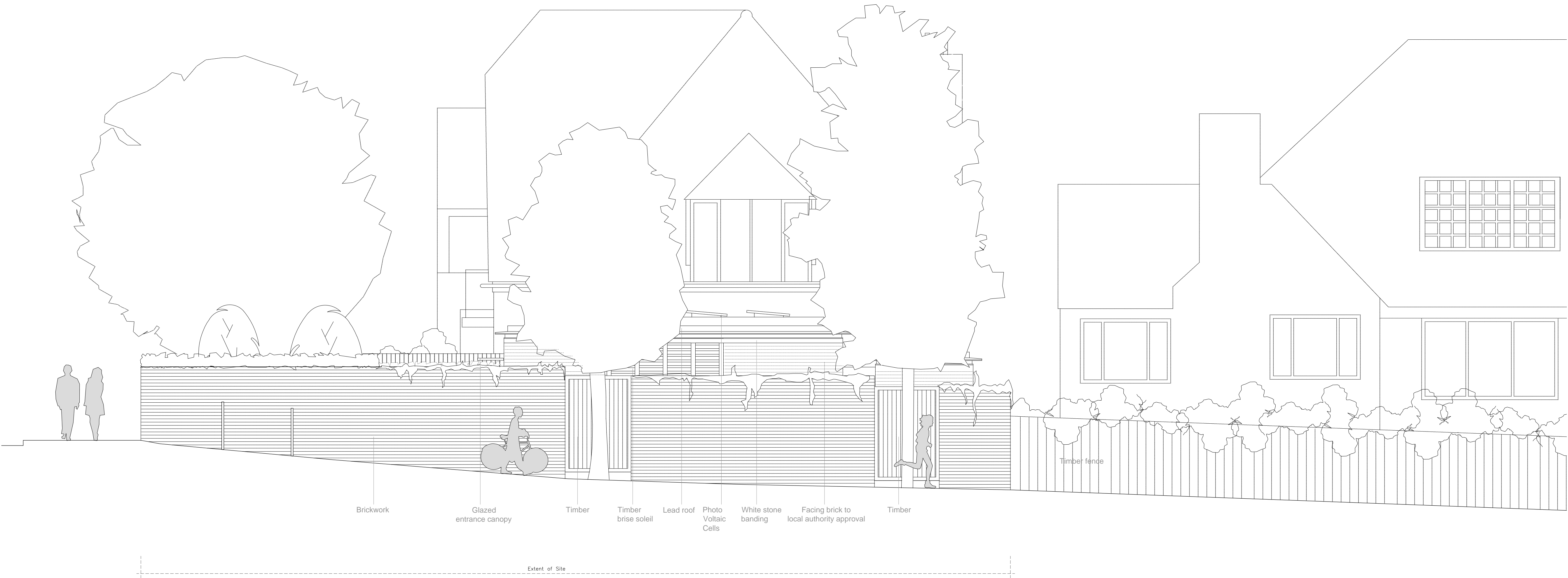
North west Elevation 90.00m AOD