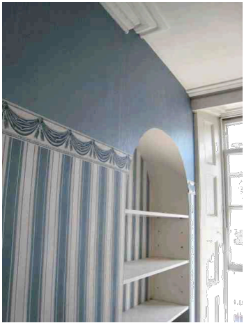
removal of non-original arches should reveal remainder of cornice