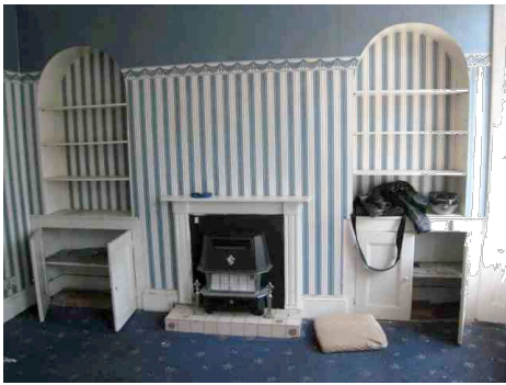
non-original shelves and arches - to be removed together with gas fire and tiled hearth