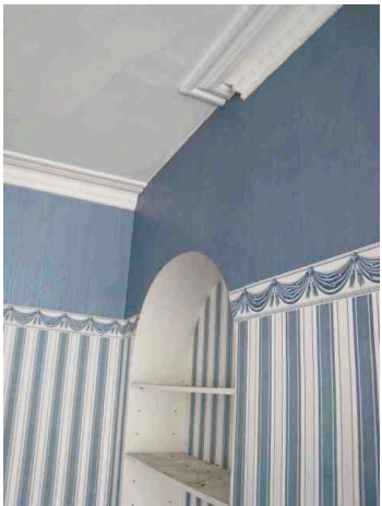
removal of non-original arches should reveal remainder of cornice