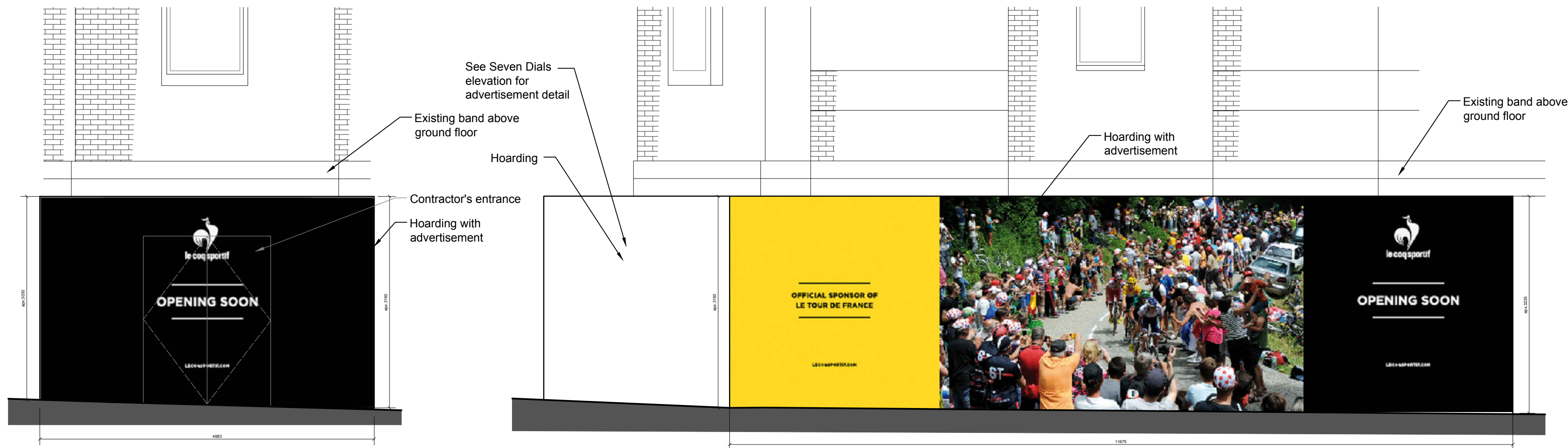
SEVEN DIALS ELEVATION

Report any discrepancies to the author. Do not scale from this drawing. Copyright Househam Henderson Architects.