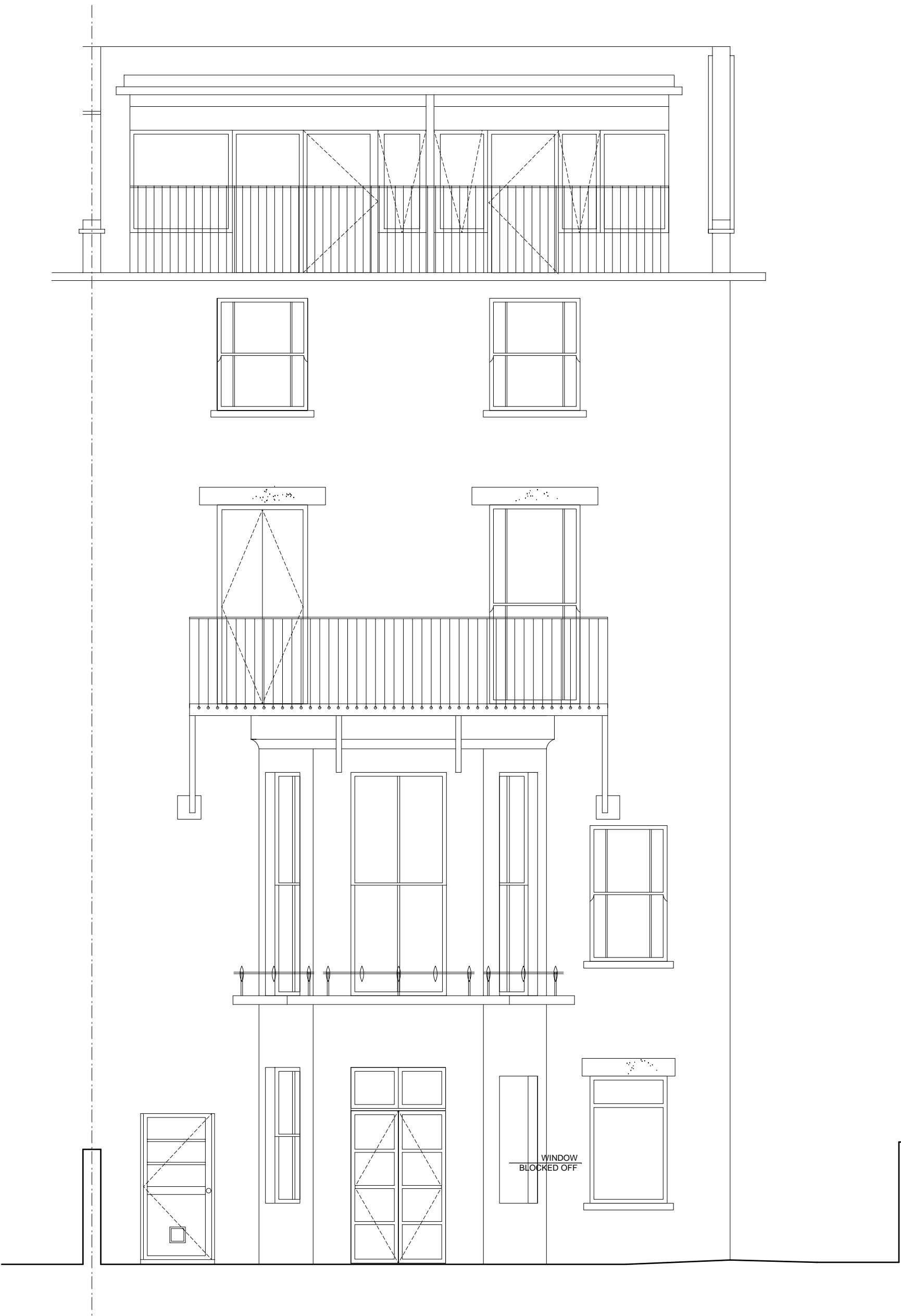
824 01 20 02: EXISTING ELEVATION: REAR