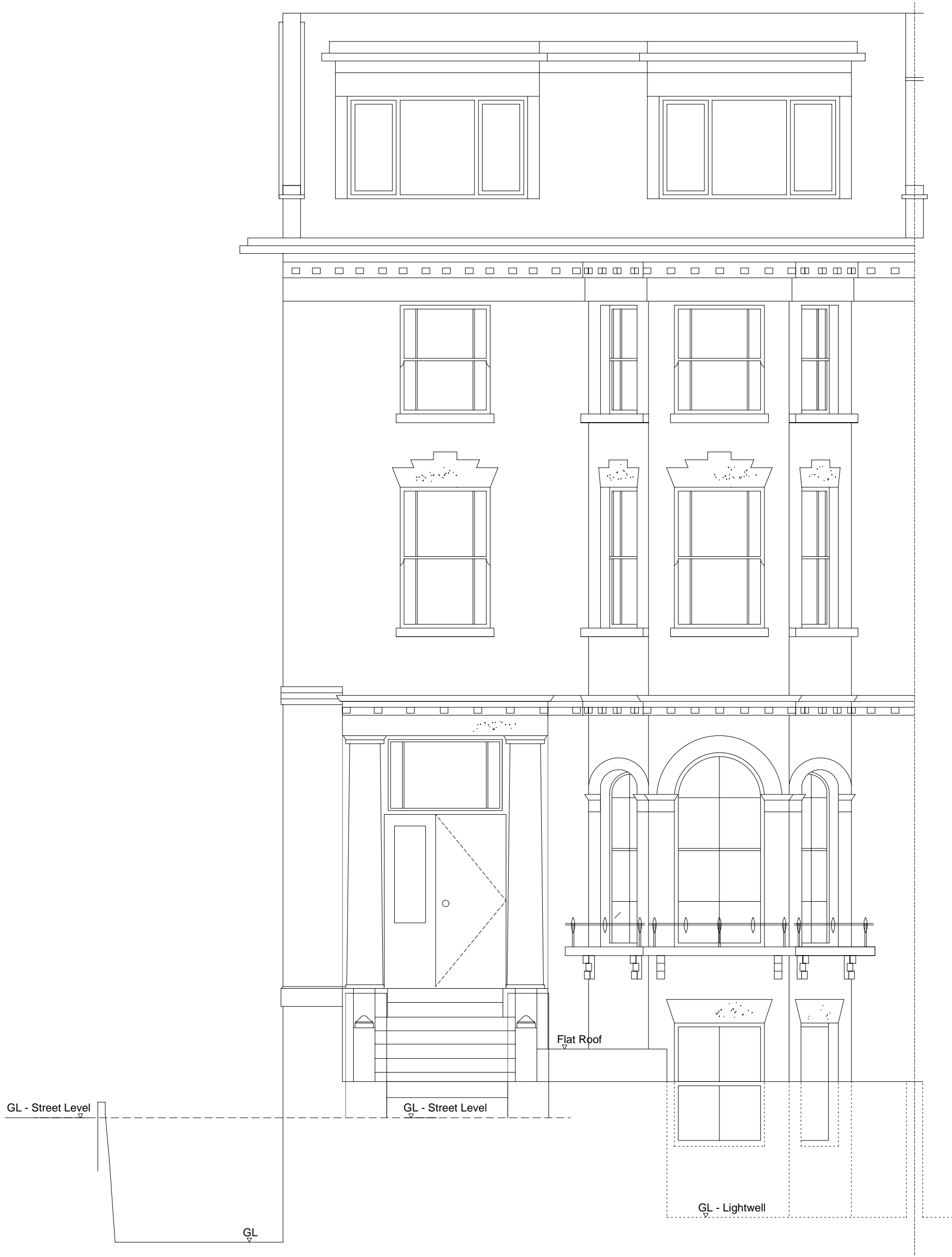
824 01 20 01: EXISTING ELEVATION: FRONT